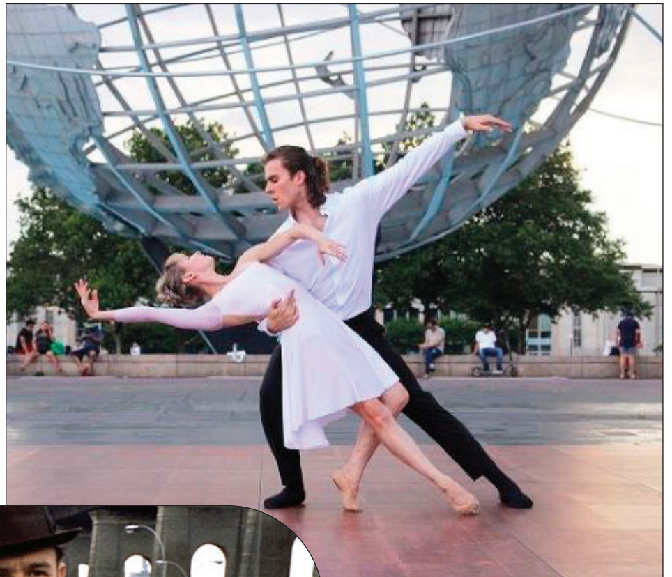
Head to Flushing Meadows Corona Park to watch cultural performances at several 1964 World's Fair sites.