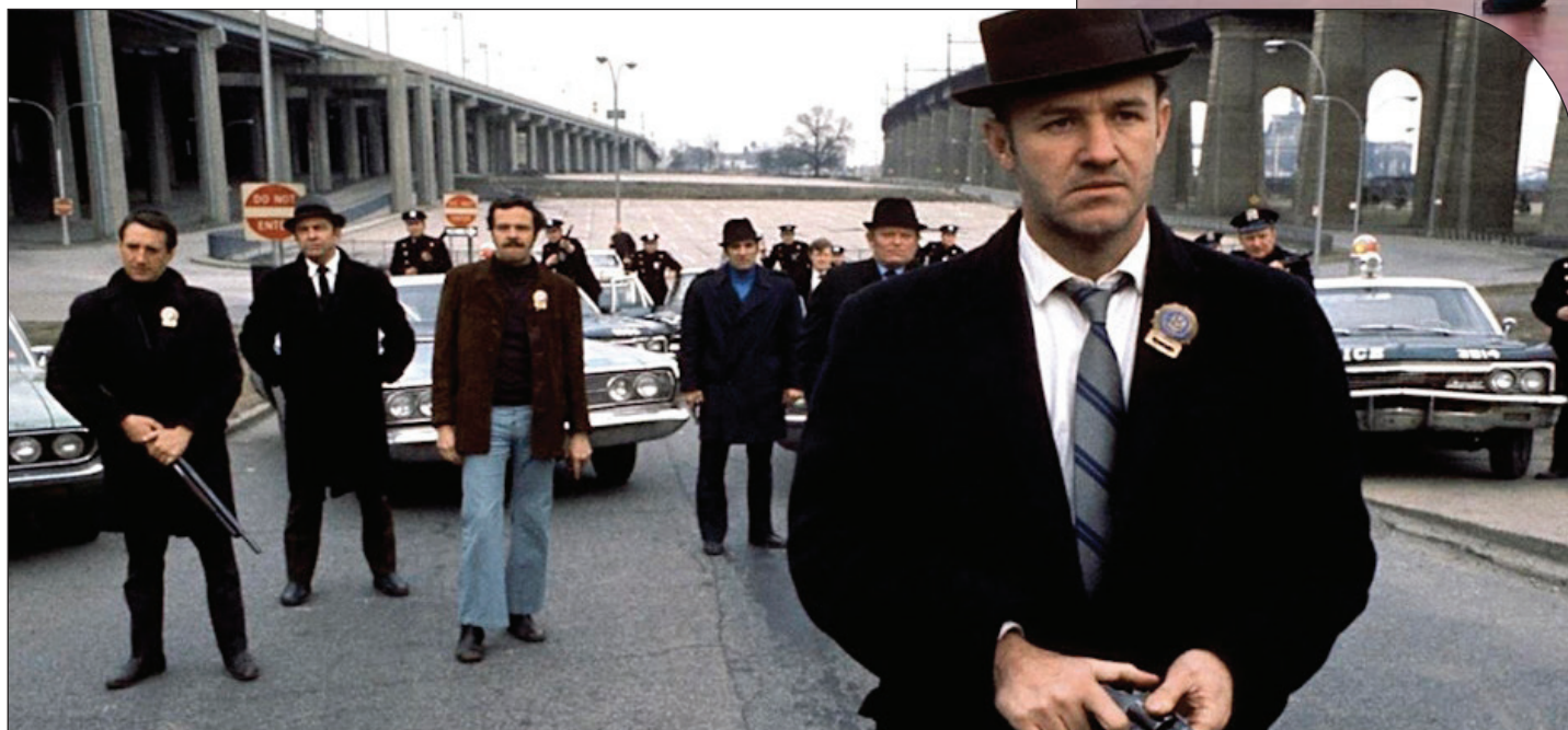
Catch a screening of "The French Connection" at Kingsland Homestead.