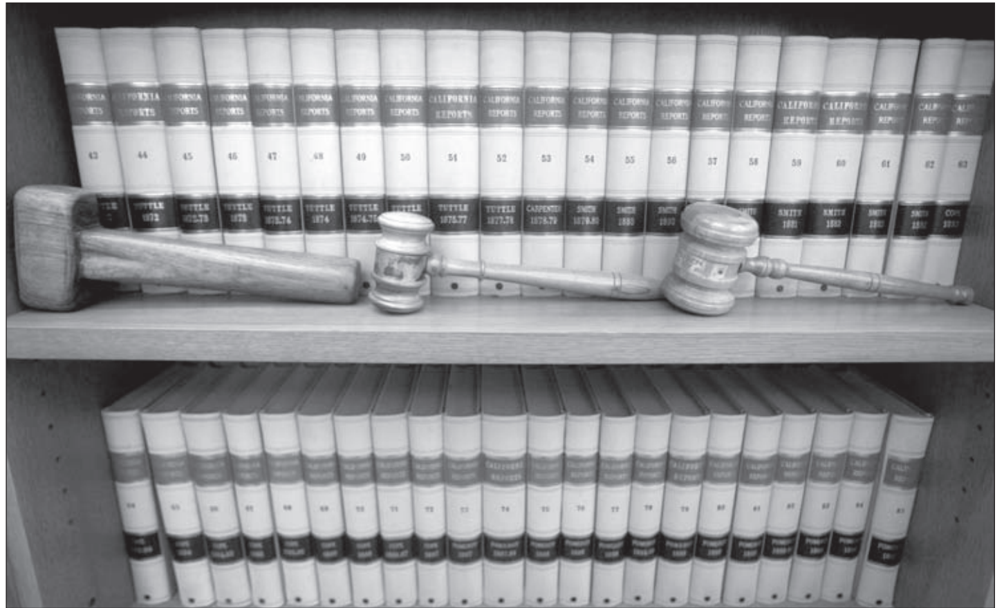
Gavels and law books are shown, July 14, 2010 in San Francisco, Calif. The Senate is set to confirm the 200th federal judge of President Joe Biden's tenure. That's about a month before then-President Donald Trump hit the 200 threshold. Trump still holds the edge when it comes to the most impactful confirmations — those to the U.S. Supreme Court and the country's 13 appellate courts.

The White House is aware of the obstacles as they rush to surpass Trump's accomplishment. It's a high water mark that remains a point of pride for the former president and senior Republicans who made it happen, including Senate Minority Leader Mitch McConnell of Kentucky. Filling dozens of judicial vacancies requires time on the Senate floor calendar, which becomes more scarce