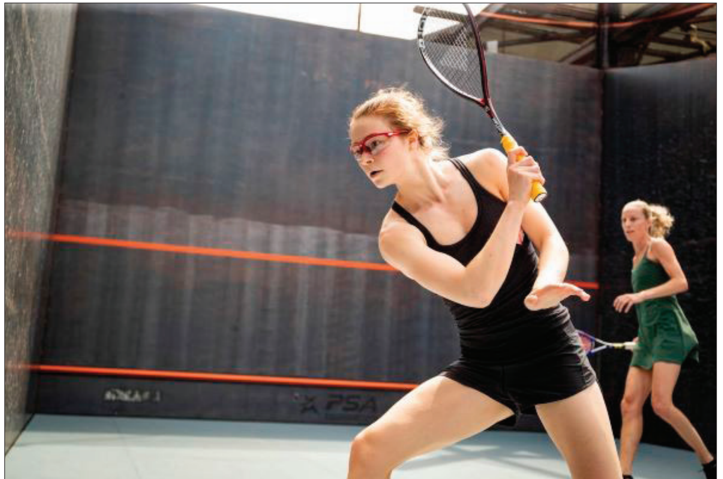
Two top squash teams – the Hamburgers and the Hot Dogs – face off in Maspeth on Saturday.

The public is invited to march past several World's Fair historical sites where dances, cultural performances, and an Aikido demonstration