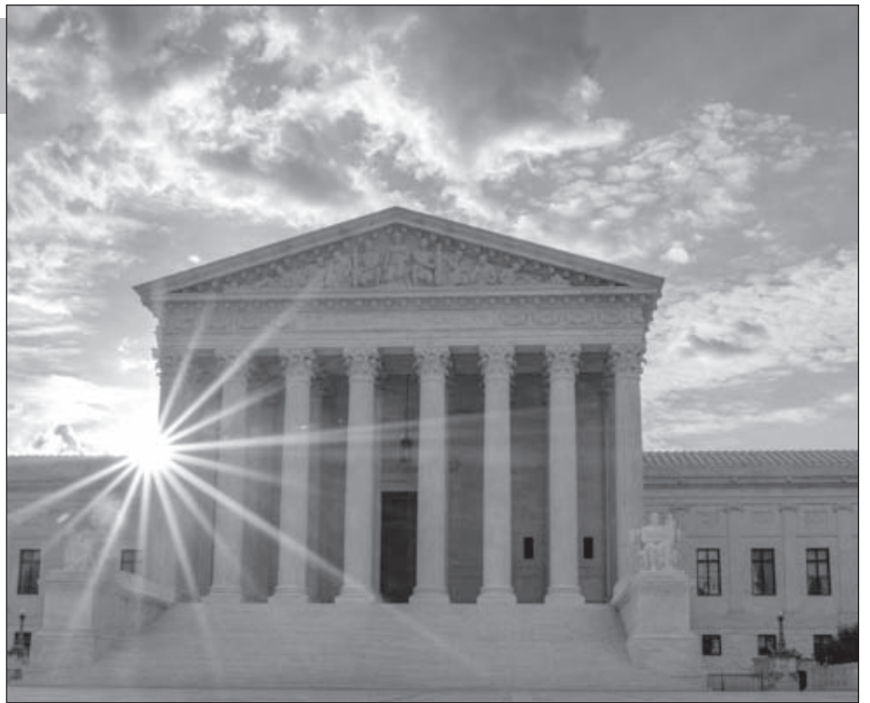
The sun flares in the camera lens as it rises behind the U.S. Supreme Court building in Washington.

In Plessy v. Ferguson , a case from 1896