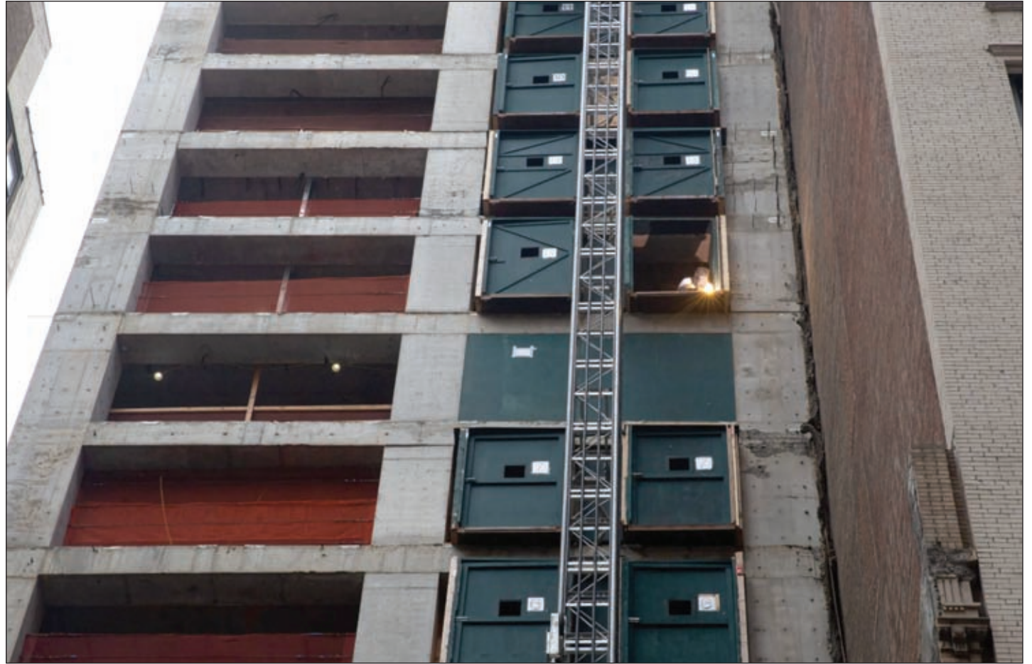
A worker cuts metal inside a hotel construction site at 58 W. 39th St., March 4, 2024.

In Hu's case, multimillion-dollar city-funded contracts to her companies' hotels continued to flow as she befriended a tightly knit core of the mayor's longtime associates, some the subject of law enforcement investigations and ethical controversies who multiple sources say pledged to go