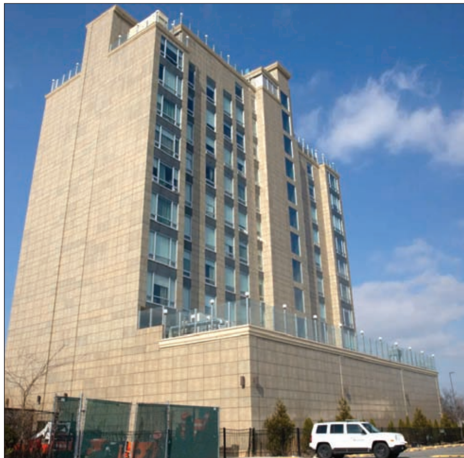
The former Wyndham Garden Hotel in Fresh Meadows, Queens, in March 2022.