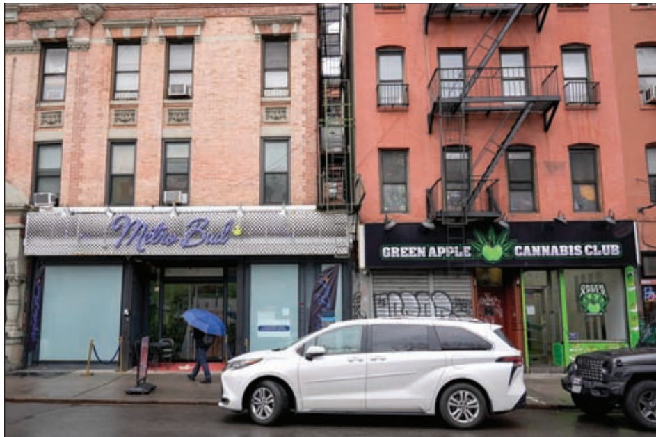
The alleged owner of a number of illegal pot shops in upstate New York was ordered to pay the state $15 million.