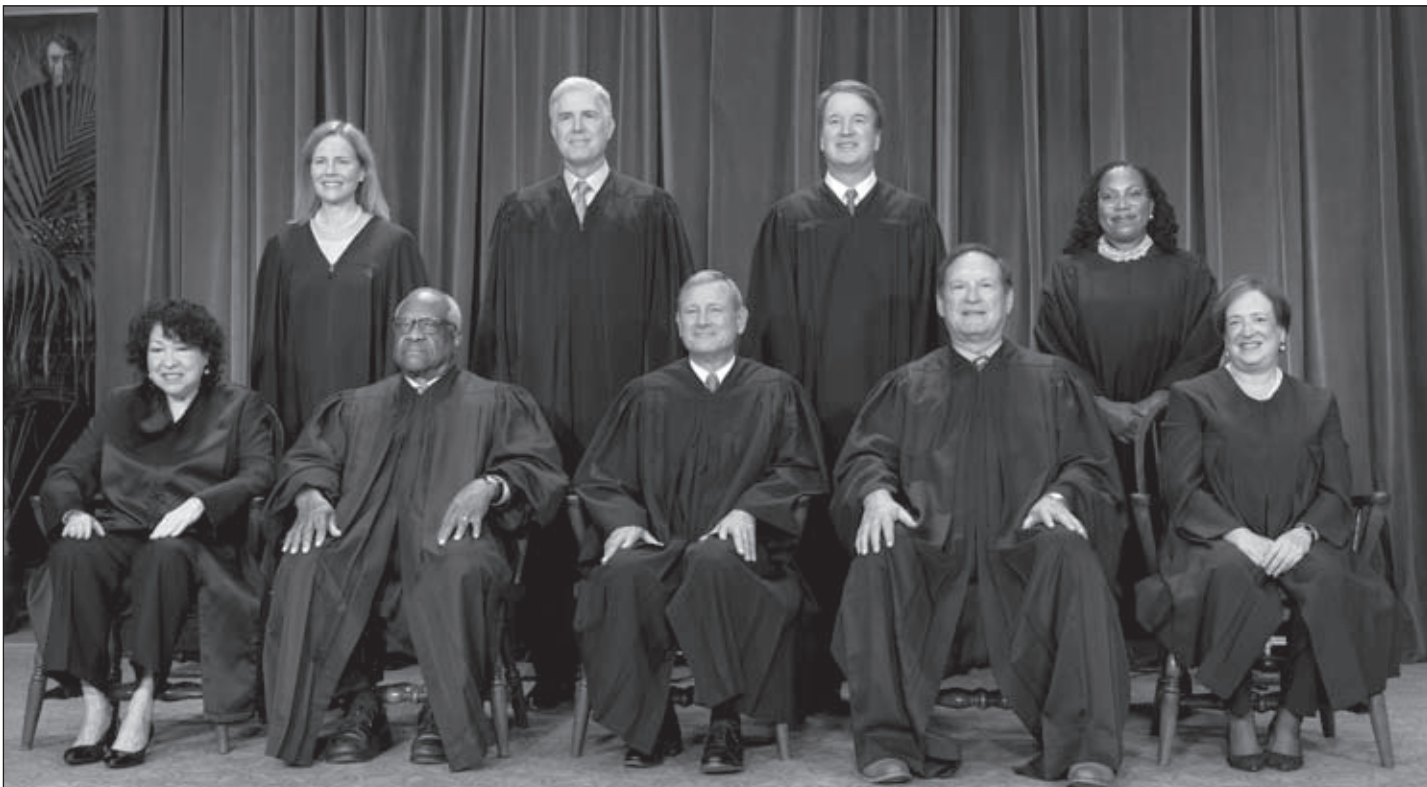
Members of the Supreme Court sit for a new group portrait following the addition of Associate Justice Ketanji Brown Jackson, at the Supreme Court building in Washington, on Oct. 7, 2022. Bottom row, from left, Associate Justice Sonia Sotomayor, Associate Justice Clarence Thomas, Chief Justice of the United States John Roberts, Associate Justice Samuel Alito, and Associate Justice Elena Kagan. Top row, from left, Associate Justice Amy Coney Barrett, Associate Justice Neil Gorsuch, Associate Justice Brett Kavanaugh, and Associate Justice Ketanji Brown Jackson.