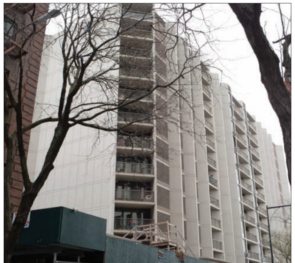
Tenants of a Mithell-Lama affordable co-op at 10 Clinton St. in Brooklyn were considering converting the building into a less profit-regulated corporation, April 17, 2024.

THE CITY is an independent, nonprofit news outlet dedicated to hard-hitting reporting that serves the people of New York.