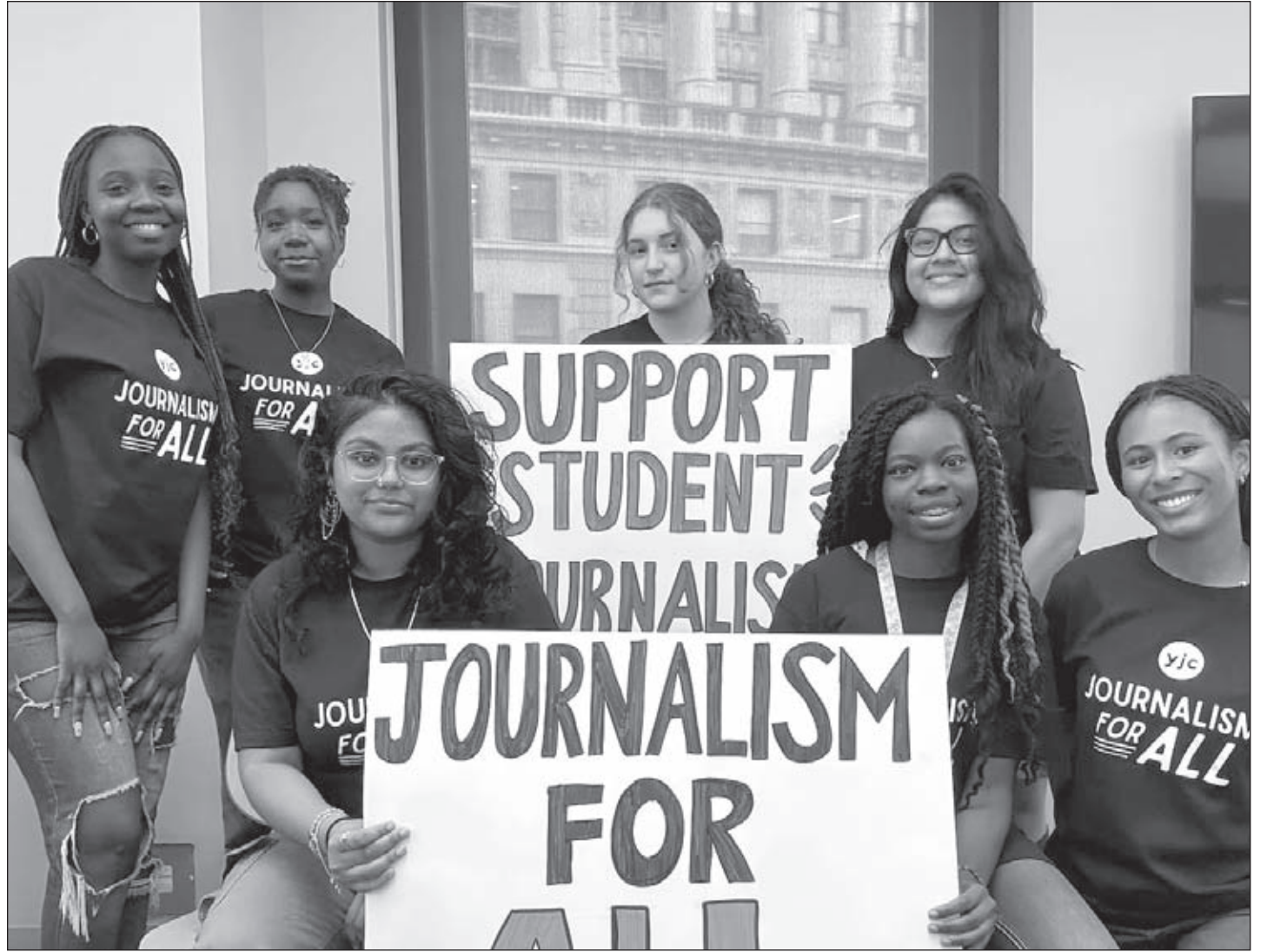
Students, educators, and advocates from the Youth Journalism Coalition held a day of action at City Hall on Thursday, urging City Council members and other officials to support more journalism programs across the city's schools.

"This isn't only a journalism challenge —