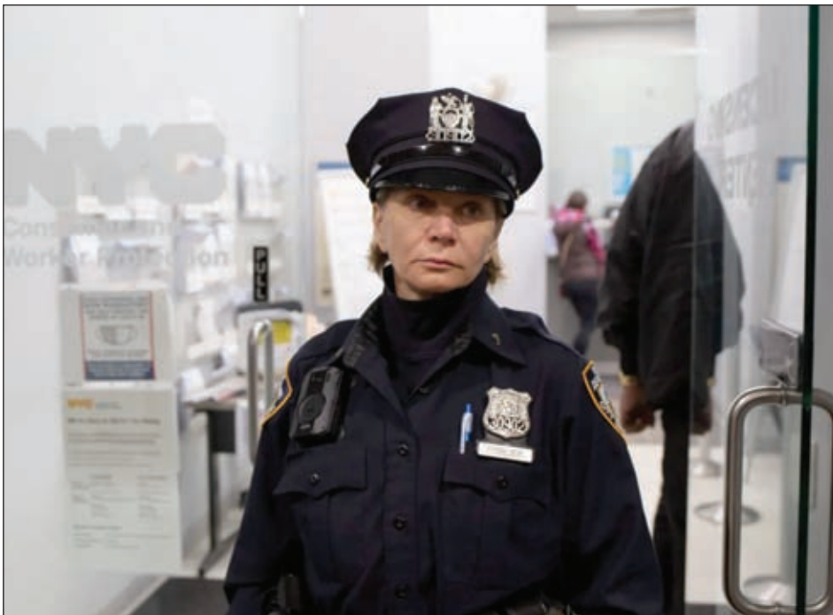
An NYPD officer guards the entrance to the city’s Department of Consumer and Worker Protection while street vendors tried to demand licenses, April 18, 2024.

THE CITY is an independent, nonprofit news outlet dedicated to hard-hitting reporting that serves the people of New York.