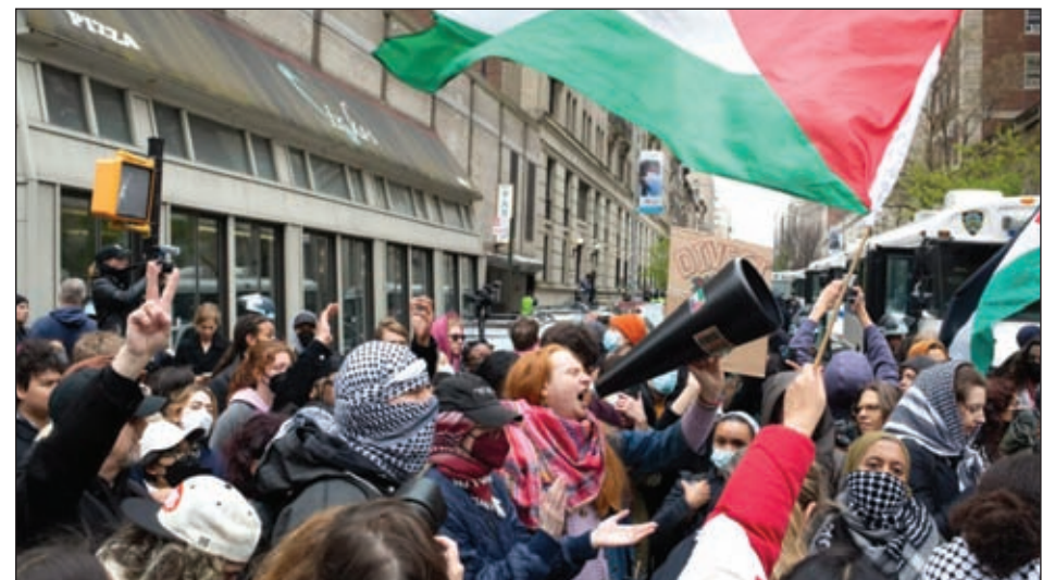
Pro-Palestine advocates protest outside Columbia University in solidarity with students occupying part of the campus, April 18, 2024.