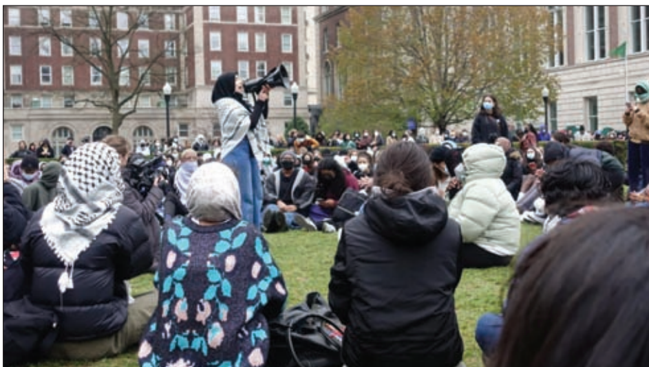
Pro-Palestine Columbia University students occupy part of campus, April 18, 2024.

THE CITY is an independent, nonprofit news outlet dedicated to hard-hitting reporting that serves the people of New York.