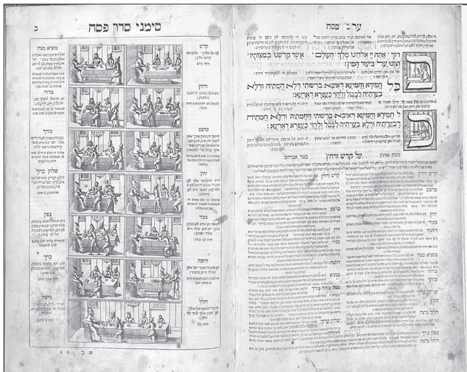
The Amsterdam Haggadah’s illustrations set a precedent for centuries.

The Amsterdam Haggadah proved to be incredibly influential on later versions,