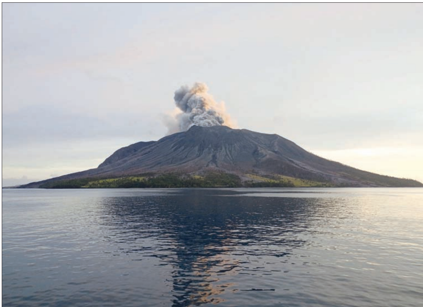
INDONESIA — Nature's revenge — the hot liquid bowels of the Earth cause evacuation: This photo provided by the Indonesian National Search and Rescue Agency (BASARNAS) shows a view of an eruption of Mount Ruang on Sulawesi Island, Indonesia, Friday, April 19, 2024. More people living near the erupting volcano on Indonesia's Sulawesi Island were evacuated on Friday due to the dangers of spreading ash, falling rocks, hot volcanic clouds and the possibility of a tsunami.

Photo: National Search and Rescue Agency via AP