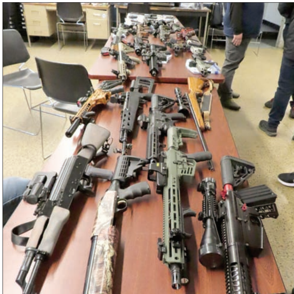
Law enforcement seized an arsenal of illegal weapons from a Rockaway Beach home last week, Queens District Attorney Melinda Katz said.

"For those who think they are safe placing orders online and assembling deadly weapons in the comfort of their home, they need to think again," Katz said. "So far this year, we have recovered 69 percent of the ghost guns seized citywide and we will continue to meticulously go after illegal guns and those who stockpile them. Every gun that we seize is a potential tragedy averted."