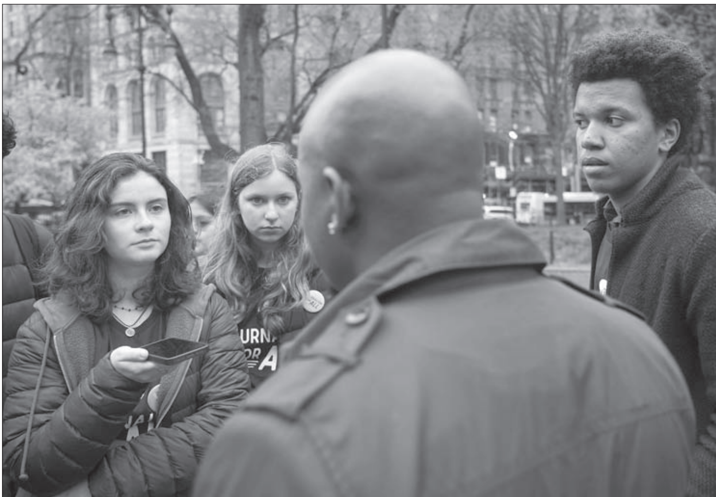
The Youth Journalism Coalition held a day of action at City Hall on Thursday.

Chalkbeat is a nonprofit news site covering educational change in public schools.