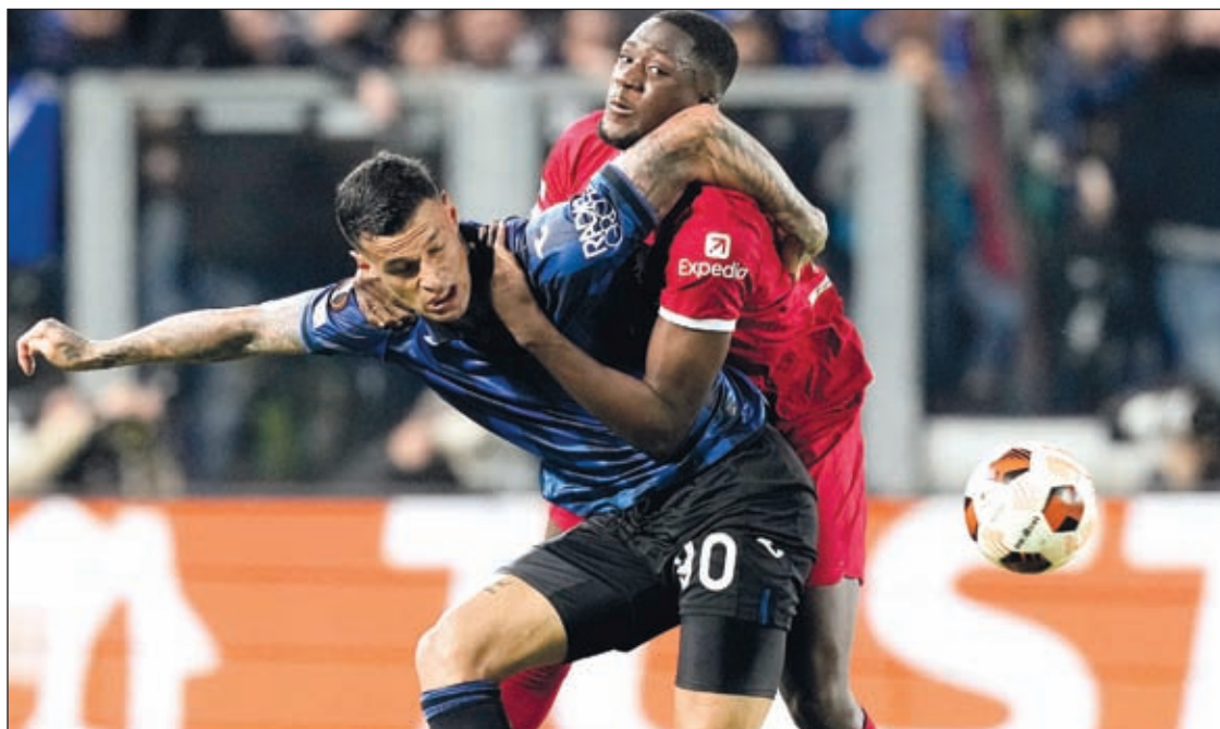
BERGAMO — 'Can't grab the ball, but I can damn sure grab you!' Liverpool's Ibrahima Konate fights for the ball with Atalanta's Gianluca Scamacca, left, during the Europa League quarterfinal, second leg, soccer match between Atalanta and Liverpool at the Stadio di Bergamo, in Bergamo, Italy, Thursday, April 18, 2024.