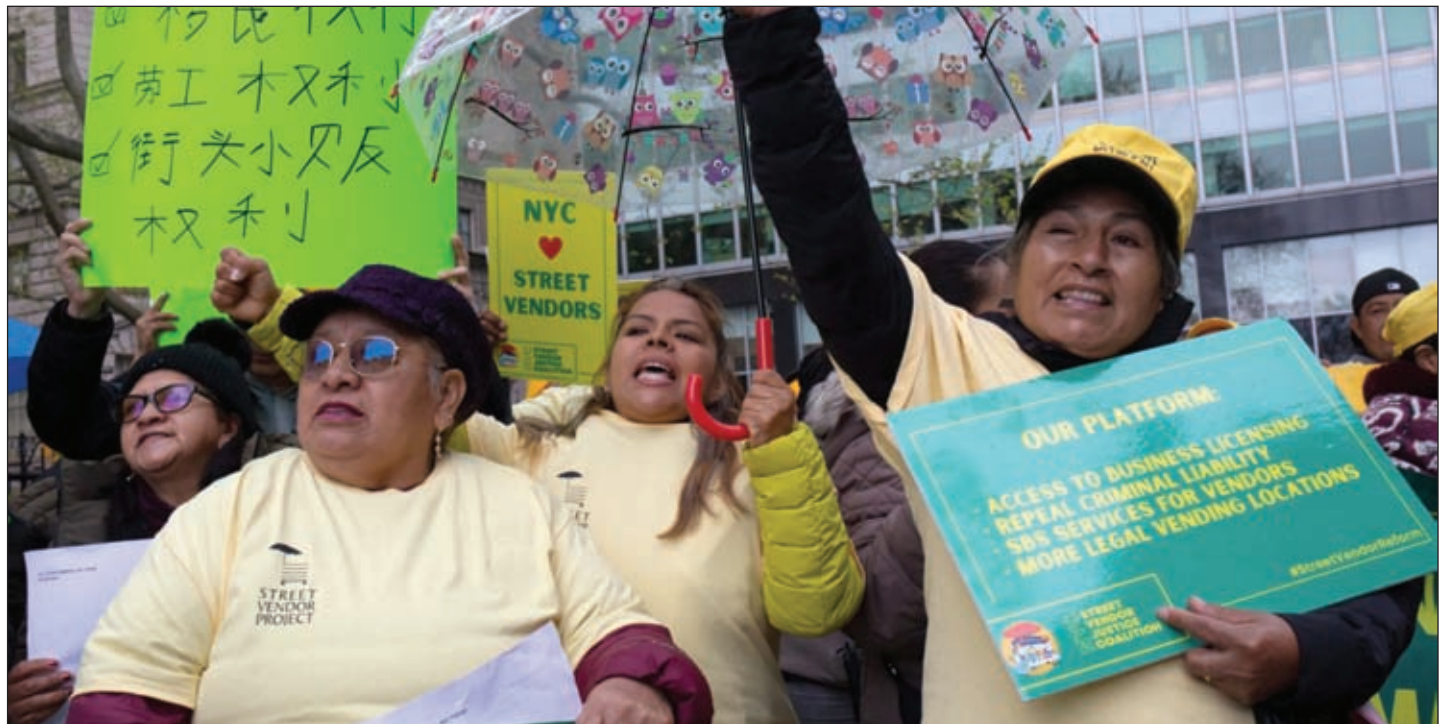
Street vendors rally in Bowling Green for the city to create more licenses, April 18, 2024.

Another vendor who sells on the intersection of Roosevelt Avenue and Junction Boulevard, and who declined to be named, said she was slapped with a $250 ticket by NYPD officers who also confiscated her merchandise on Monday.