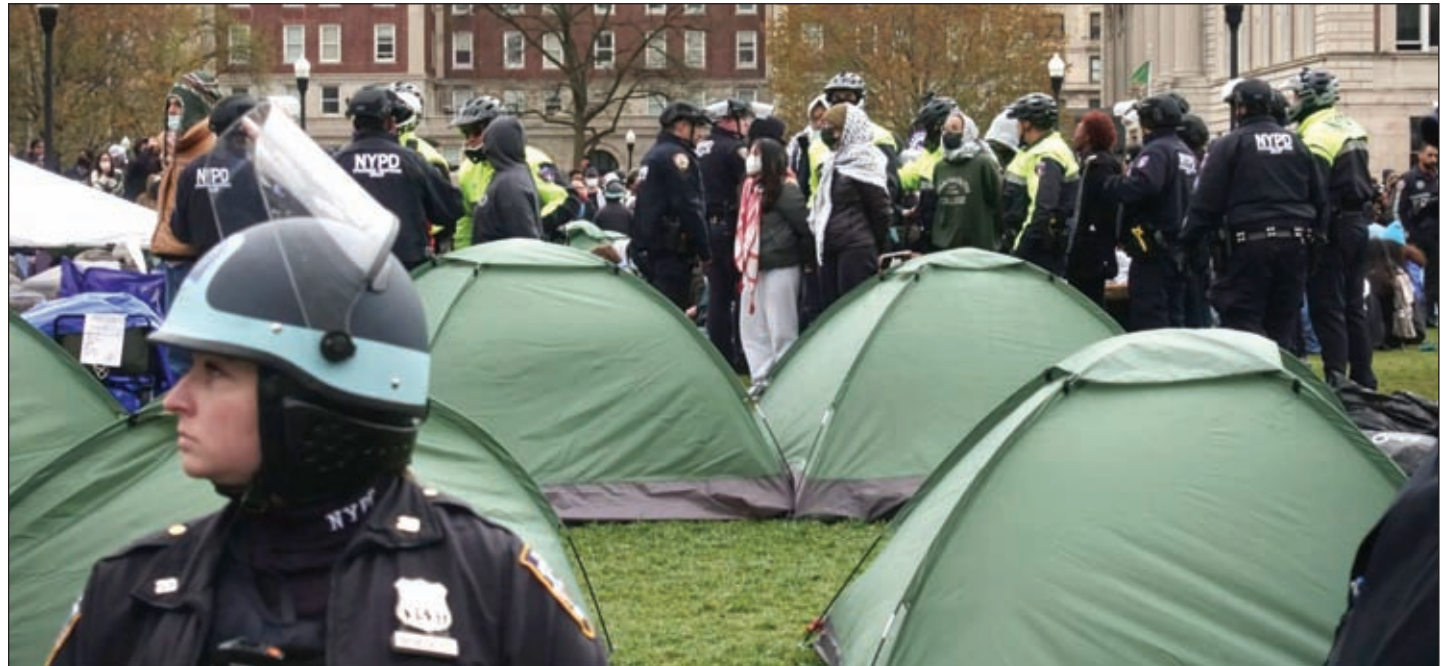
NYPD officers arrest pro-Palestine Columbia University students occupying a lawn on campus, April 18, 2024.

"A peaceful protest is not in violation of city laws," Adams said, though he added because the