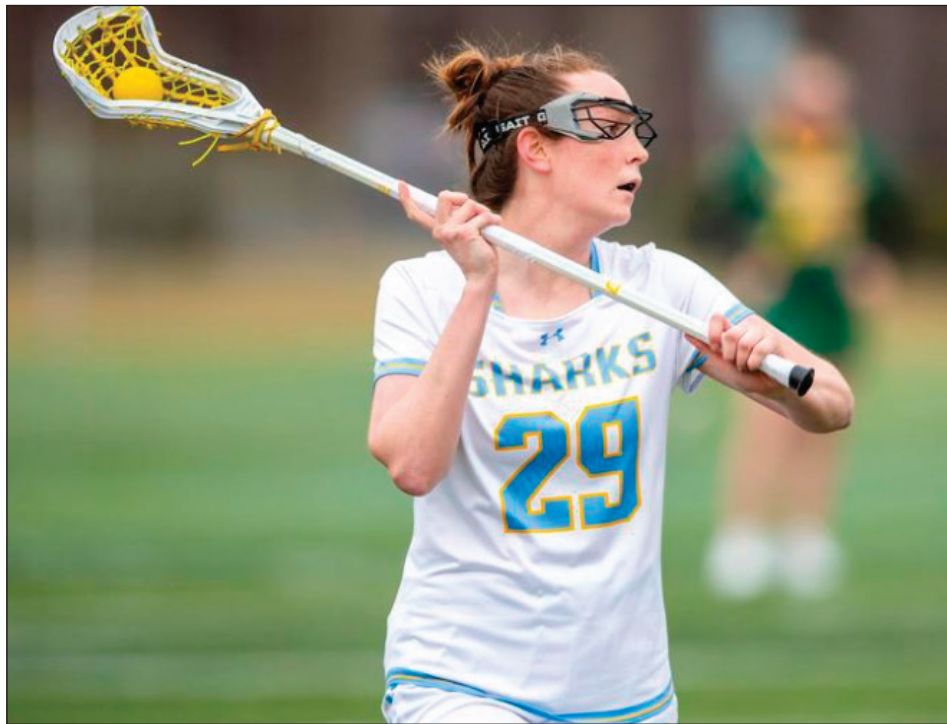
An LIU women's lacrosse player is seen here. LIU's women's lacrosse team said goodbye to 12 student-athletes on Senior Day.