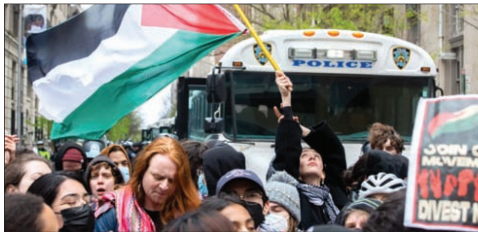
Pro-Palestine advocates protest outside Columbia University in solidarity with students occupying part of the campus, April 18, 2024.