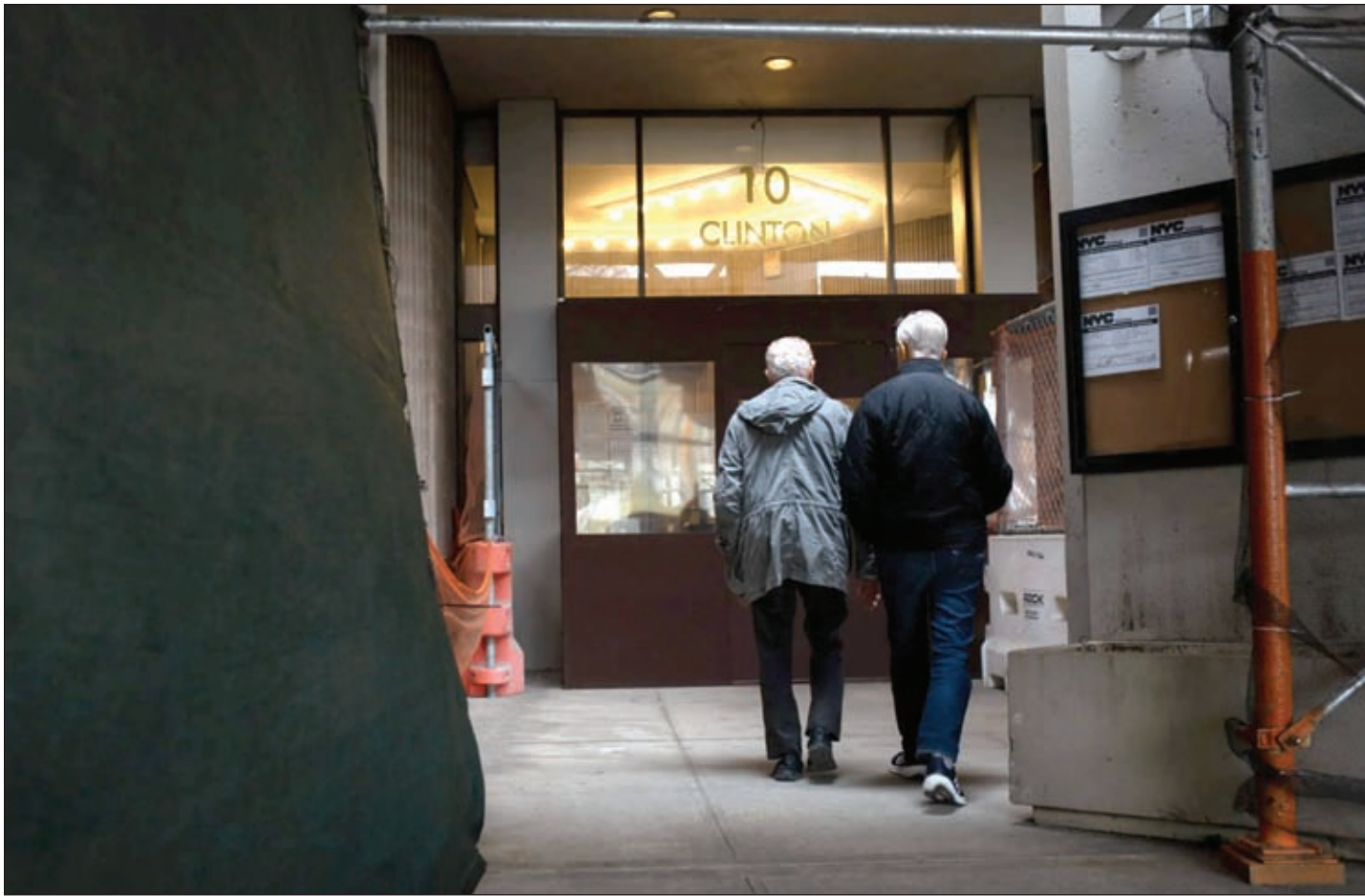
Tenants of a Mitchell-Lama affordable co-op at 10 Clinton St. in Brooklyn were considering converting the building into a less profit-regulated corporation, April 17, 2024.