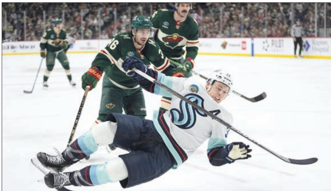
ST. PAUL — The Wild West of hockey — tripping, hip checks and elbows to the face are indiscretions that fans have come to expect: Minnesota Wild right wing Mats Zuccarello (36) trips Seattle Kraken center Yanni Gourde, front, during the second period of an NHL hockey game Thursday, April 18, 2024, in St. Paul, Minn. Zuccarello was penalized for tripping.