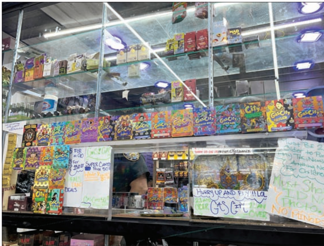
A new state law will be approved that will allow New York City to expand enforcement of illegal cannabis shops across the five boroughs.

"This is not a step backwards," echoed Adams. "This is a step forward to ensure we have legalized cannabis shops."