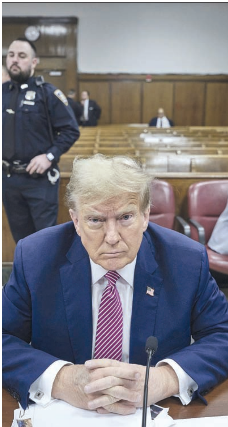
MANHATTAN — 'Let the record show — at this table, my angry demeanor will not change...': Former President Donald Trump appears at Manhattan criminal in New York, Friday, April 19, 2024.