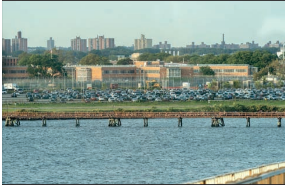
The federal monitor tracking conditions on Rikers Island said that the jail complex remains “dangerous and unsafe, characterized by a pervasive, imminent risk of harm to both people in custody and staff,” in a new report last week.