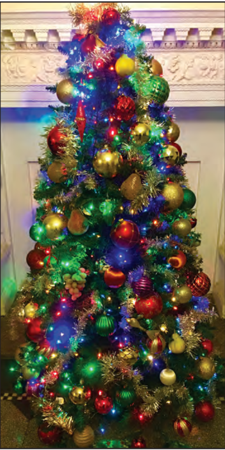
New York City celebrates Christmas.