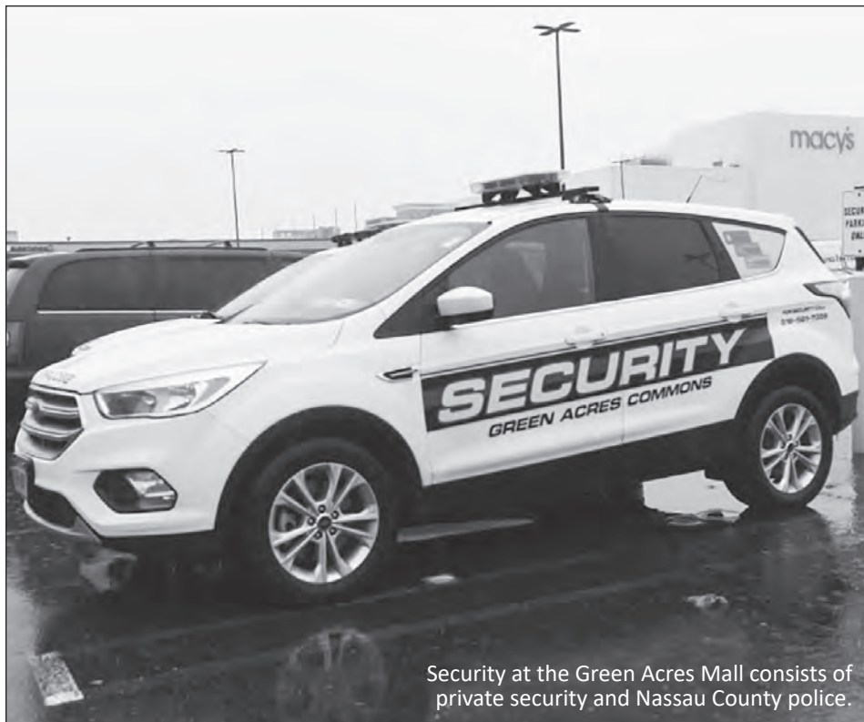
Security at the Green Acres Mall consists of private security and Nassau County police.