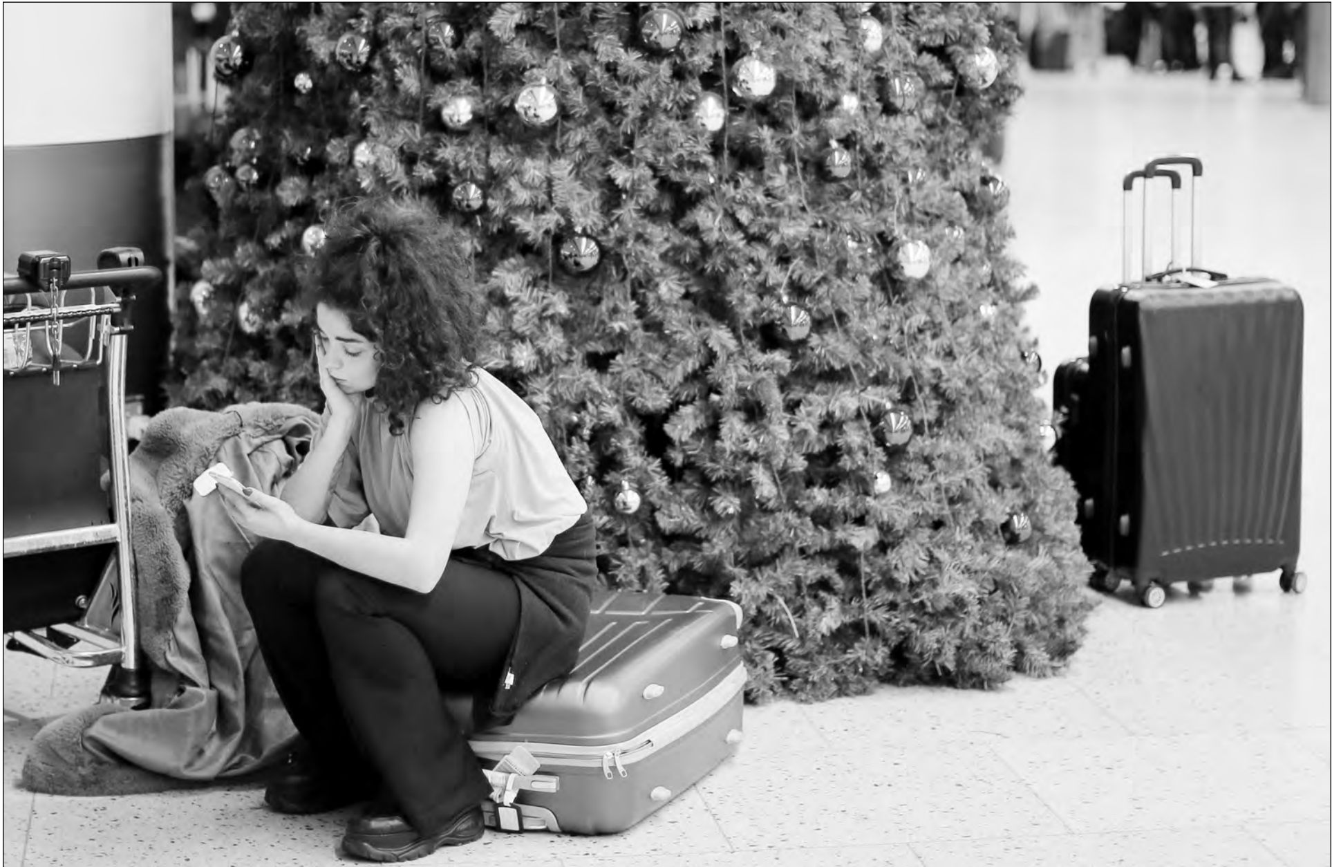
BRITAIN — Drones Ruin Christmas Travel: London's Gatwick airport temporarily closed on Thursday, amid the busy holiday travel, with incoming flights delayed or diverted to other airports after drones were spotted over the airfield.