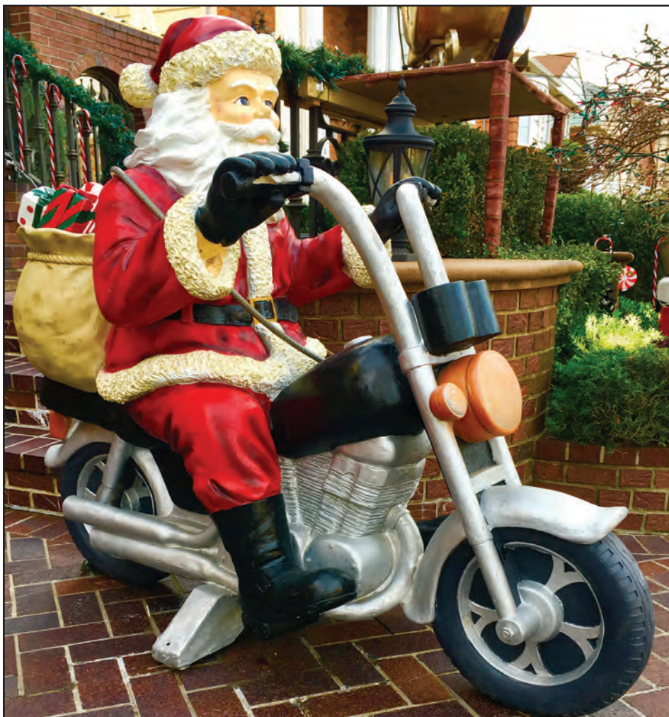
Merry Christmas and Happy Holidays from the Queens Daily Eagle .