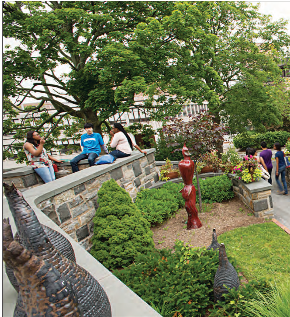
CUNY Queensborough College in Bayside.

The researchers also surveyed 3,100 New Yorkers on what they consider the top inequality issue in the city, finding that affordable housing and income inequality or unemployment ranked highest.