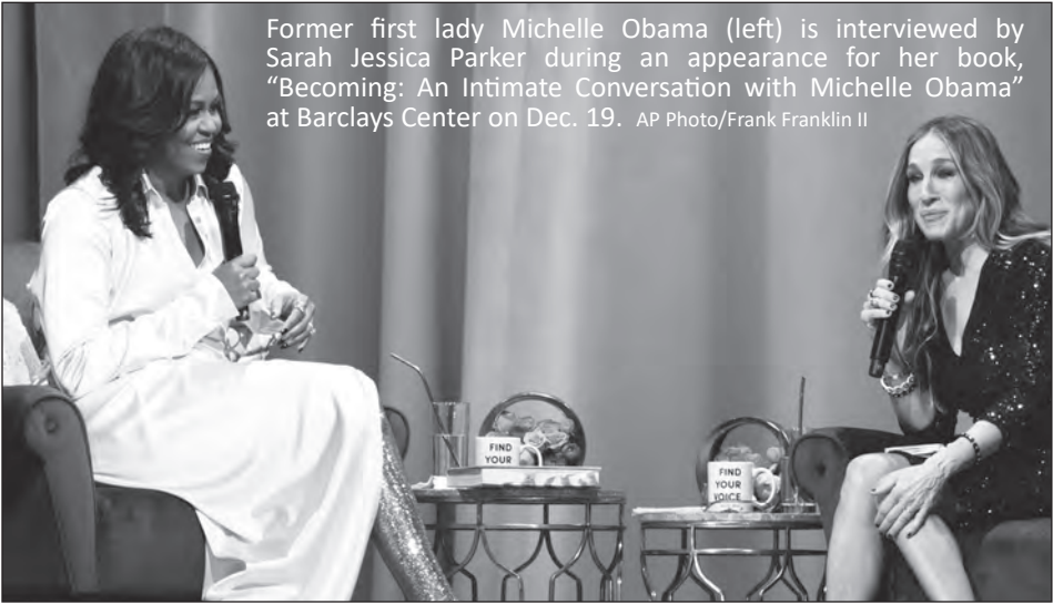
Former first lady Michelle Obama (left) is interviewed by Sarah Jessica Parker during an appearance for her book, "Becoming: An Intimate Conversation with Michelle Obama" at Barclays Center on Dec. 19.

"I did know that my clothes were making a statement, I knew that was the case," she said. "So we decided why don't we use this platform to uplift some young new designers who normally wouldn't get this kind of attention, because you can change their lives, which is one of the reasons why we chose Jason Wu for my inaugural gown."