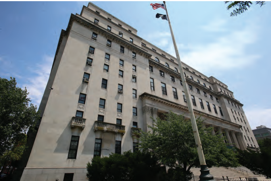
Unauthorized individuals have sought shelter inside the Queens Civil Supreme Courthouse on Sutphin Boulevard.

Yet because of disrepair, discomfort and potential danger many people who experience