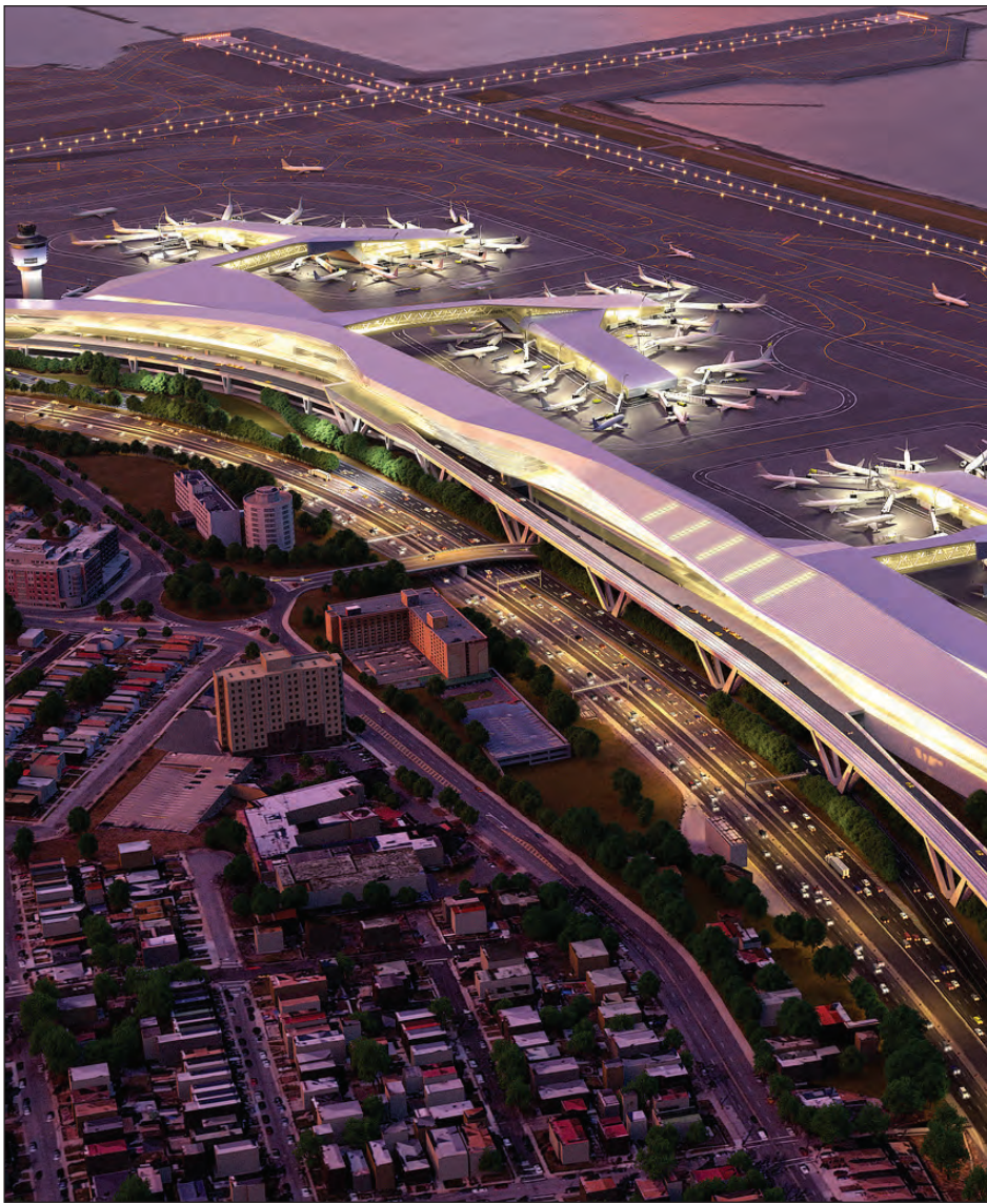
Rendering of LaGuardia Airport, where an employee allegedly used a cellphone to film a woman in the bathroom.