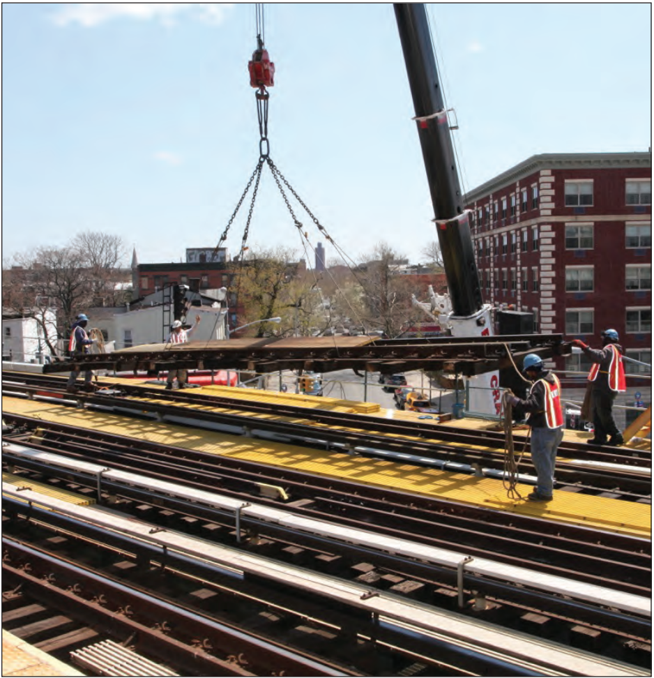
An old panel is hooked up to crane for removal during maintenance work along the J line in 2014.

Though the MTA noted that the reconstruction project was purposely scheduled to take place during many schools' winter break periods, city public schools resume classes on Jan. 2, in the middle of the maintenance period.