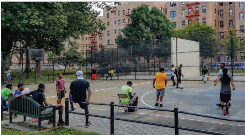
Rufus King Park in Jamaica.

A high-resolution image of the map can be viewed on the Parks website. For poster lovers, a full-size limited edition print version of the map can be purchased at the NYC Parks Pop-Up Holiday Shop at the Union Square Holiday Market until Dec. 24.