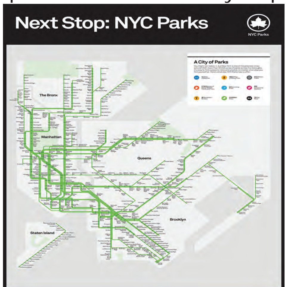
The New York City Parks Department's take on the iconic New York City subway map features neighborhood parks.