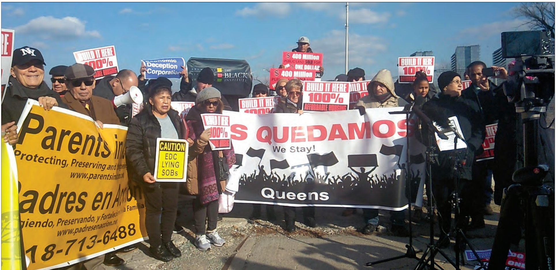
The community coalition Nos Quedamos demonstrates for affordable housing at Willets Point.