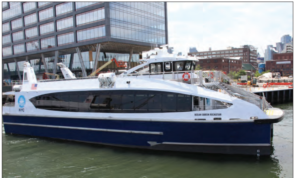
The new 350-passenger Ocean Queen Rockstar will accommodate increased ferry ridership.