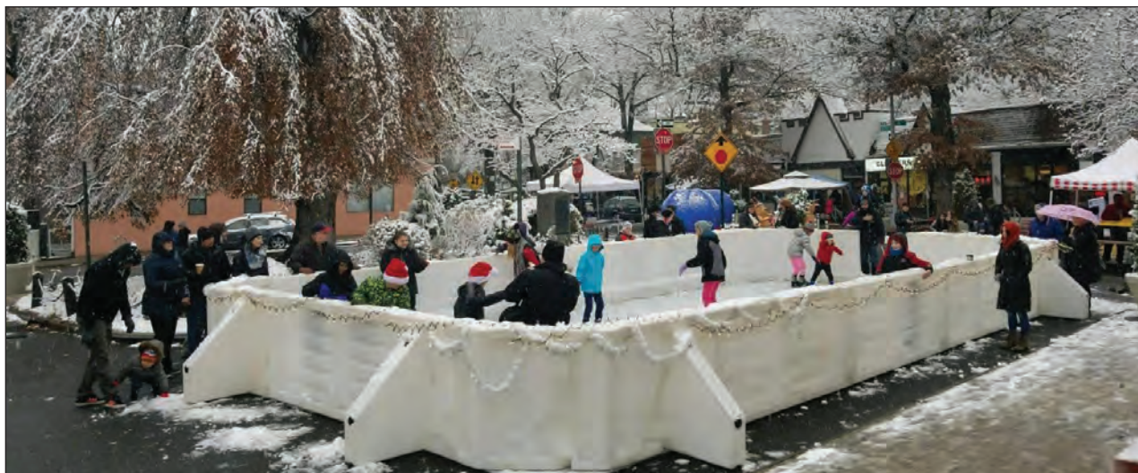
The Douglaston Winter Festival will take place on Saturday afternoon.

The Wine Room of Forest Hills at 96-09 69th Ave in Forest Hills