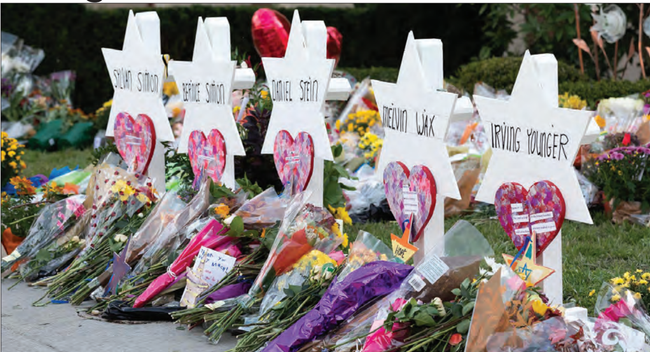
A memorial grows outside the Tree of Life Synagogue in the Squirrel Hill neighborhood in Pittsburgh.