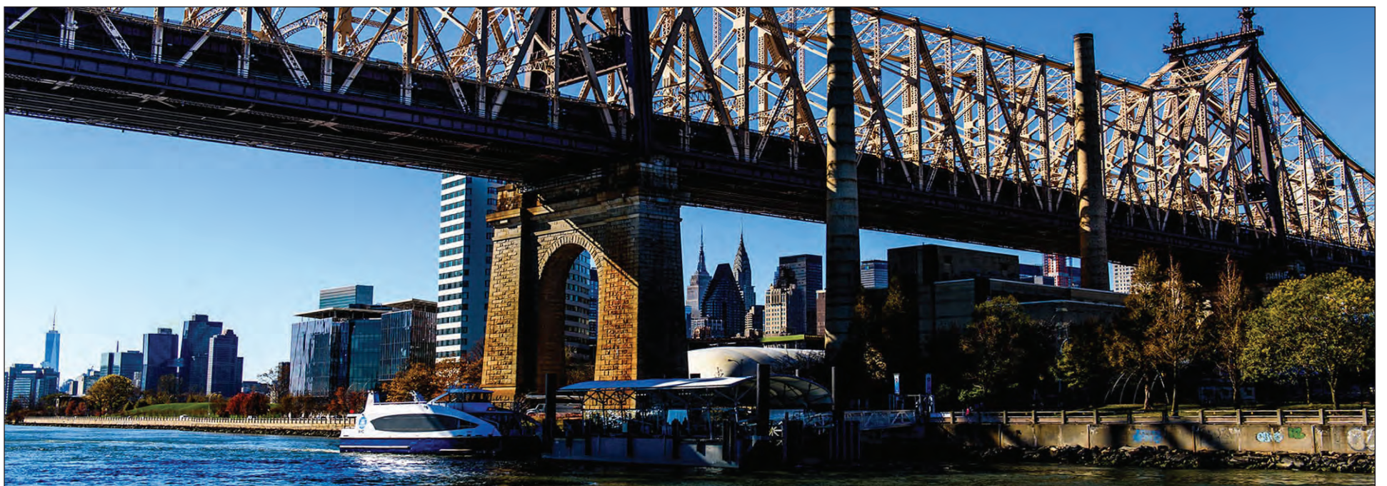
An Astoria Route ferry stops at Roosevelt Island.