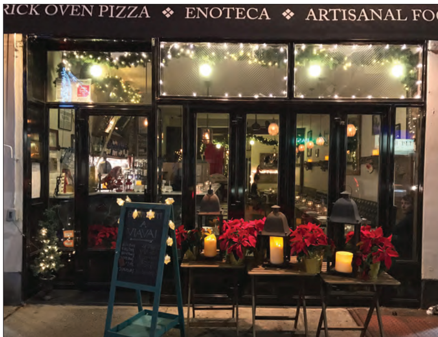
VIA VAI in Astoria was recognized by the 2019 Michelin Guide.

The "It's In Queens" column is produced by the Queens Tourism Council with the hope that readers will enjoy the borough's wonderful attractions. More info at itsinqueens.com .