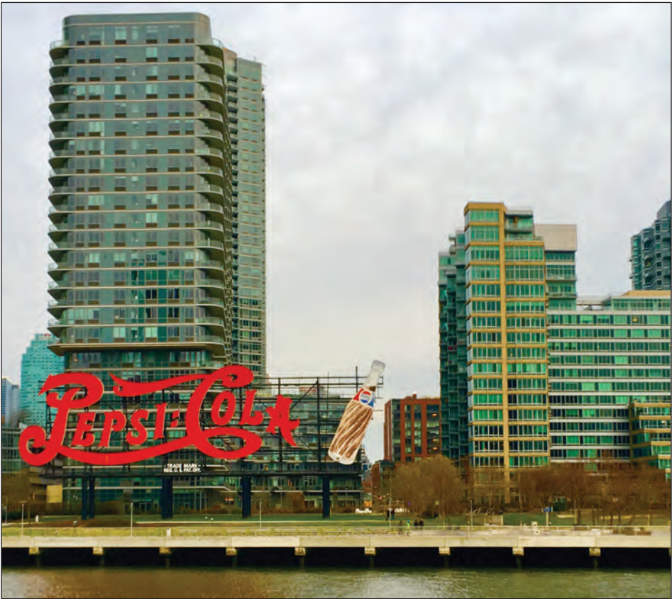
Long Island City viewed from the East River Ferry.