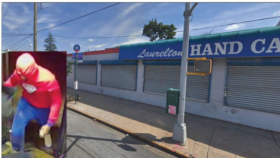
A bus stop on Merrick Boulevard near 220th Street, where a bus driver was punched in the face by a passenger. Background photo via Google Maps, inset.