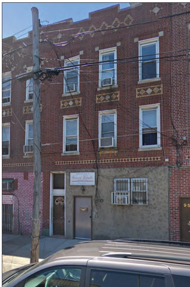
95-32 150th Street in Jamaica.