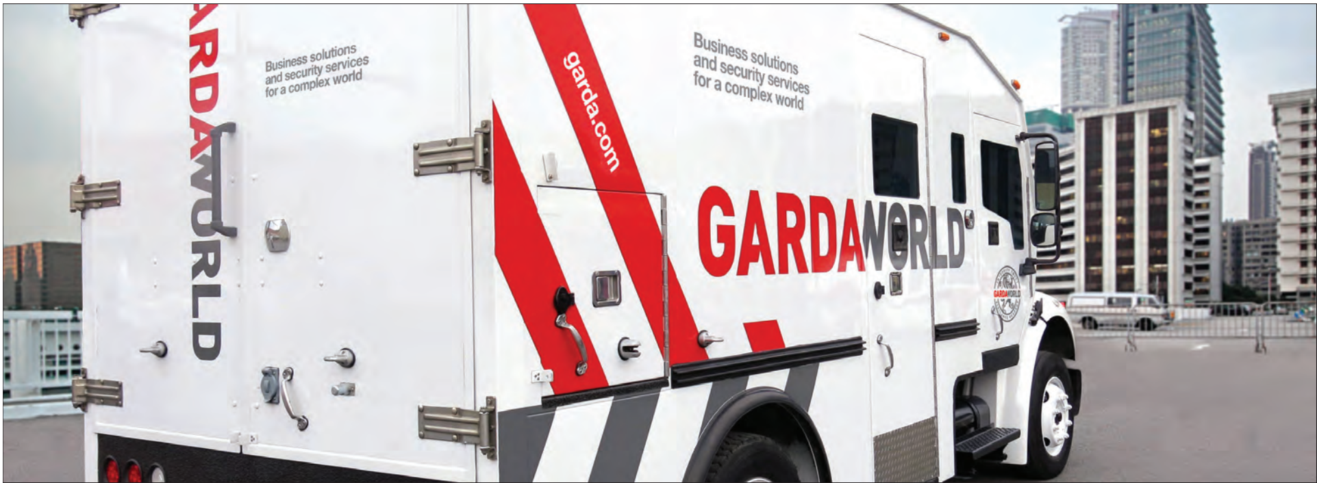
A GardaWorld armored truck.