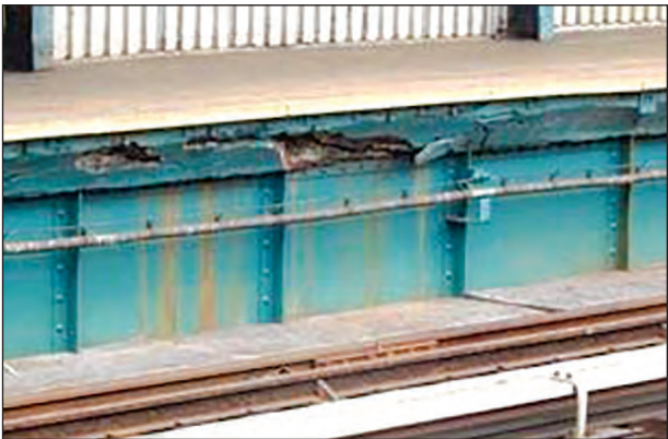
Platform girder deterioration at 111th Street.