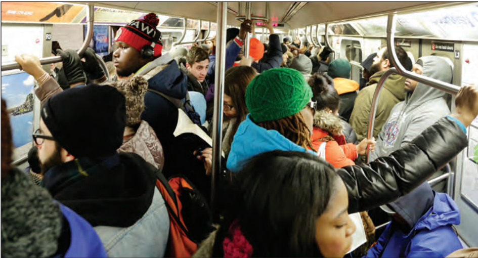
Commuters crowd an L subway train, Monday, Jan. 25, 2016, in Brooklyn

Between Nov. 1 and Dec. 16, 2017, seven sex crimes on the no. 7 train were reported to the NYPD.