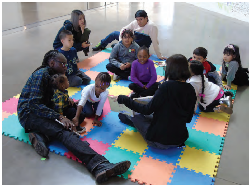
Parents reading with their children

A winter recess workshop for youngsters who wants to create decorative ornaments. Plus, storytelling sessions at 1:30 pm, 2:30 pm, and 3:30 pm. Free. Queens Museum, NYC Building, Flushing Meadows Corona Park