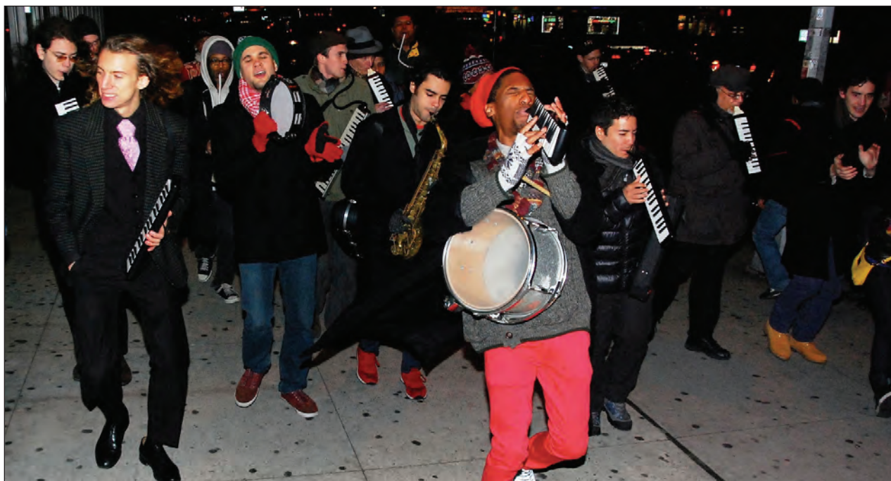
Singers, musicians, and dancers of all skill levels join a New Orleans-style second line parade as it marches through the heart of Corona to the Louis Armstrong House Museum at 34-56 107th St.