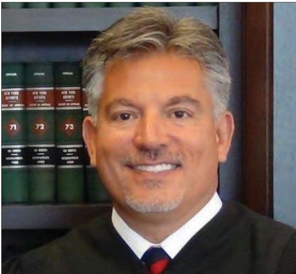
Administrative Judge Joseph Zayas has called on the state legislature to amend the 2017 conviction-sealing law.