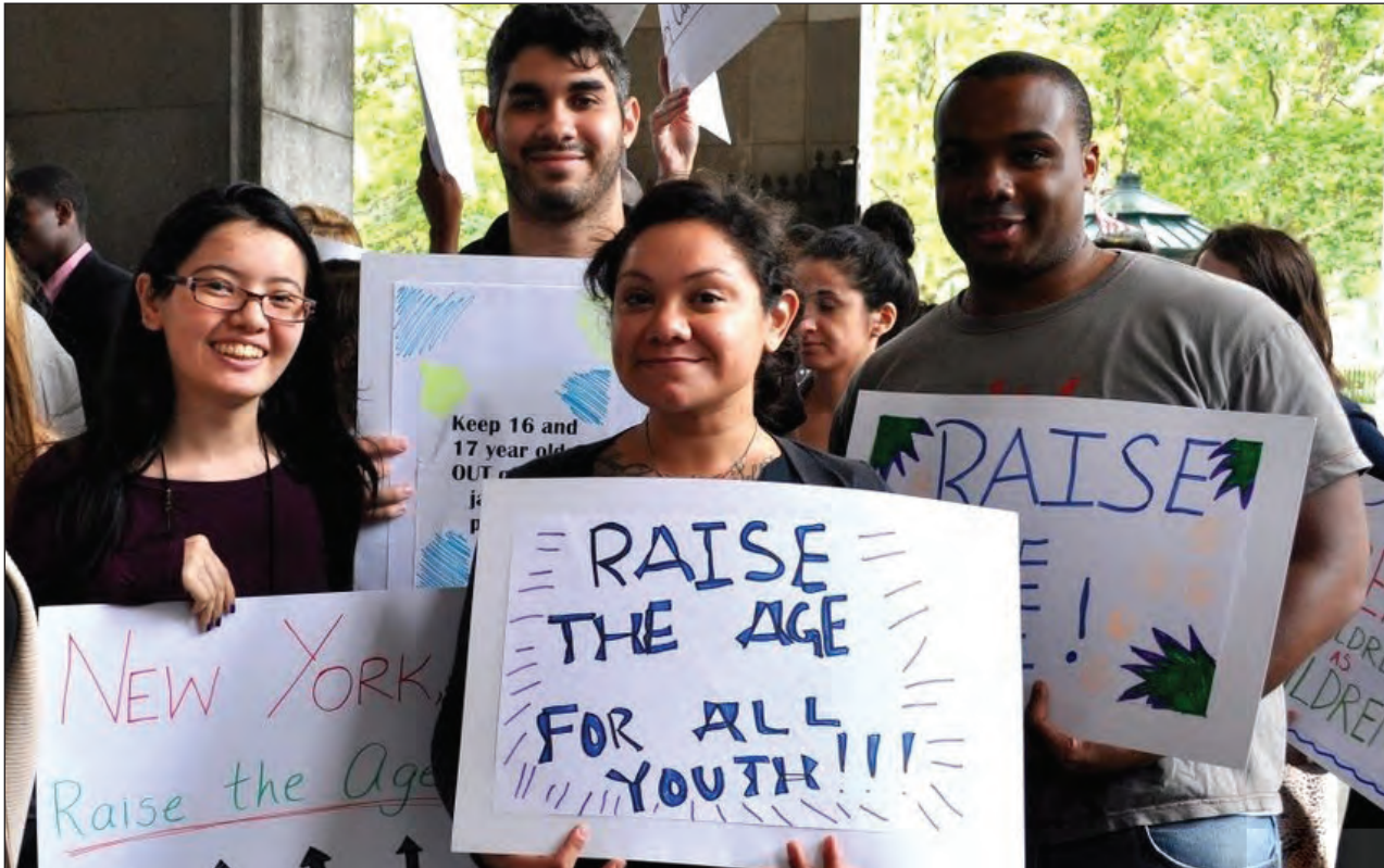
Young people demonstrate in support of Raise the Age prior to passage of the law.