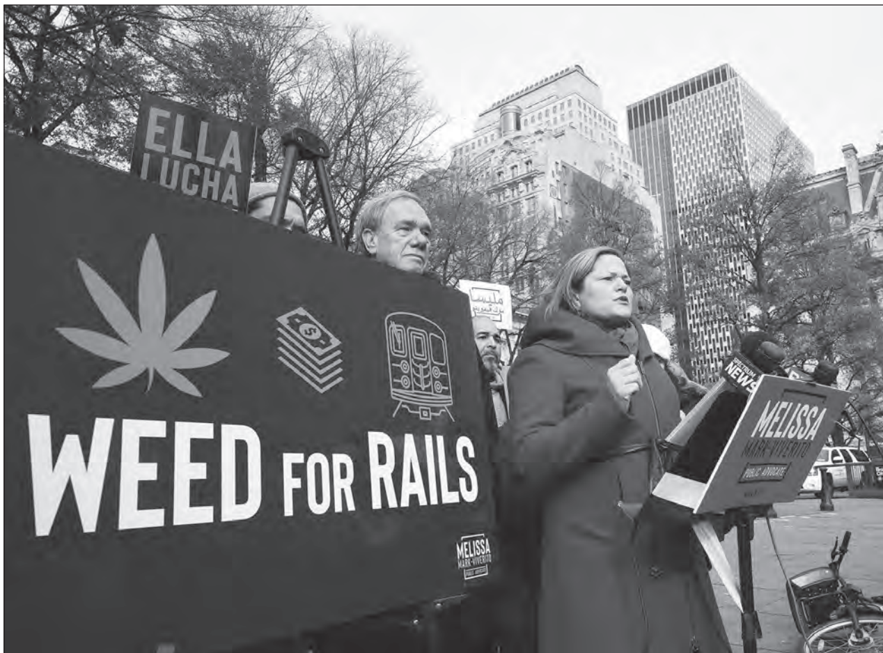
Melissa Mark-Viverito, a candidate for New York City public advocate, speaks at a news conference on Dec. 6. The former New York City Council speaker is proposing to legalize marijuana sales and use the tax revenue to help fund the city’s aging subway system.