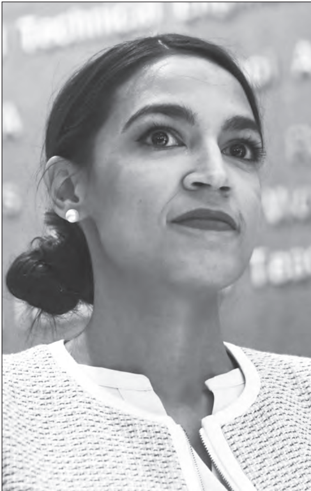
Congressmember-elect Alexandria Ocasio-Cortez is seeking to defeat U.S. Rep. Hakeem Jeffries by recruiting a Democrat to challenge him in a primary in 2020.

Starting in January, she will represent the 14th Congress-