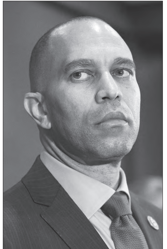
U.S. Rep. Hakeem Jeffries was recently elected to serve as chairman of the House Democratic Caucus, a high-powered position in Congress.

"It's a huge hill to climb. It's one thing to beat Joe Crow-