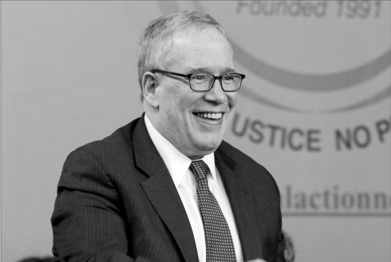
NYC Comptroller Scott Stringer backs the idea of using cannabis tax revenue to correct historic injustices in poor neighborhoods of color.

He added, “All of that will come together April 1,” the first of the New York state fiscal year.