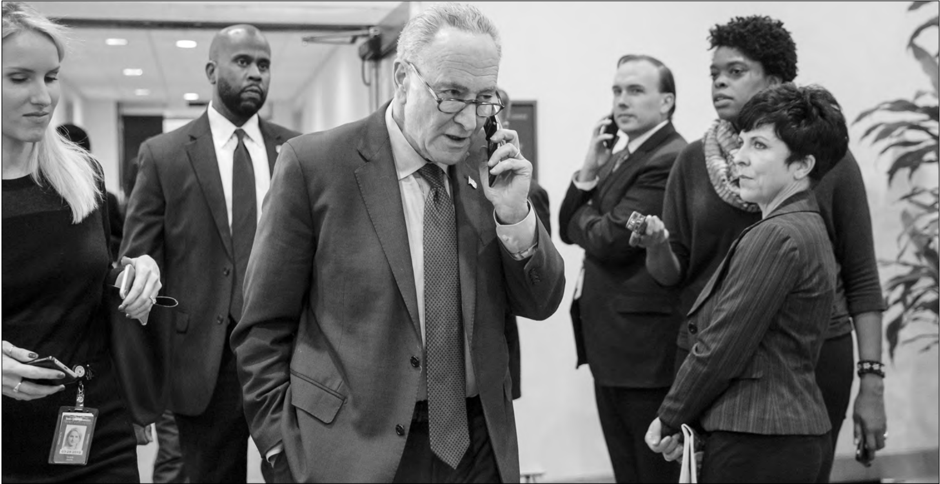
Senate Minority Leader Chuck Schumer of Brooklyn walks through the Capitol in Washington, D.C., last week. Schumer joined other liberal politicians like Sen. Bernie Sanders and U.S. Rep. Alexandria Ocasio-Cortez in a push to call for climate change policies.

House Democratic Leader Nancy Pelosi, who is seeking to become speaker in January, has indicated she will likely reinstate a special committee on climate change, although exact details have not been finalized. Pelosi created the committee when she became speaker in 2007, but it was disbanded after Republicans won back the House in 2010. Pelosi said Democrats will rebuild America with “with clean energy, smart technology and resilient infrastructure.”