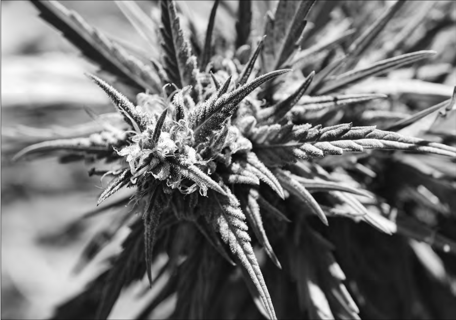
Rival factions are putting in their bids now to get a chunk of an expected windfall in marijuana tax revenue, as New York state moves closer to legalizing cannabis for adult use.