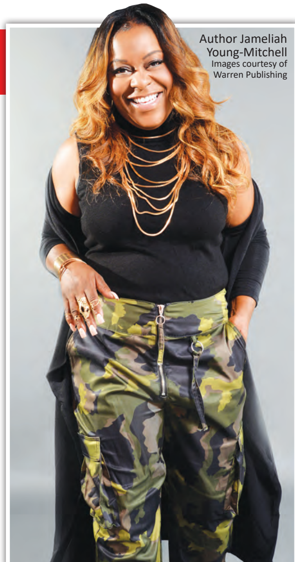
Author Jamelia Young-Mitchell