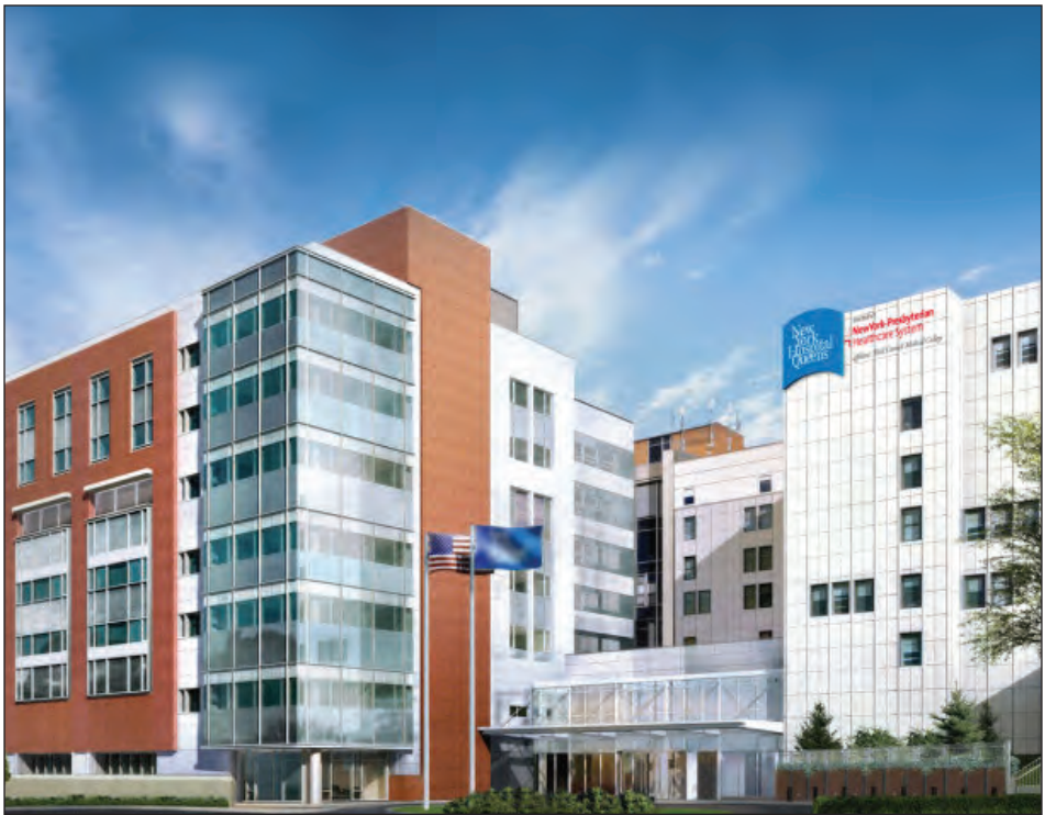
New York Presbyterian Hospital-Queens.