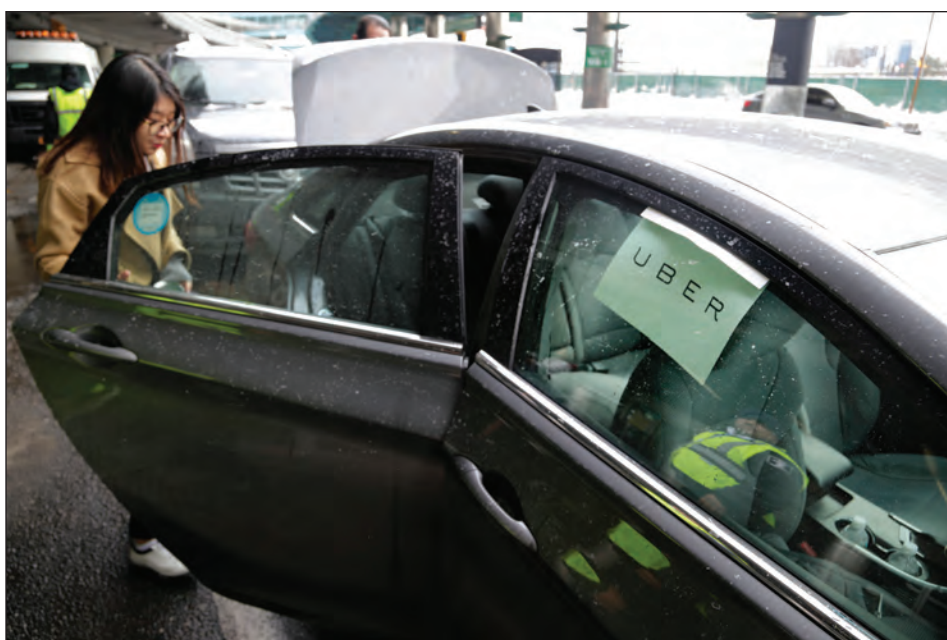
In this March 15, 2017, file photo, a passenger enters an Uber car at LaGuardia Airport in New York. Taxi regulators on Tuesday, Dec. 4, 2018, in New York City, approved new minimum pay standards for app-based car services that they say will raise drivers' annual earnings by $10,000 a year.