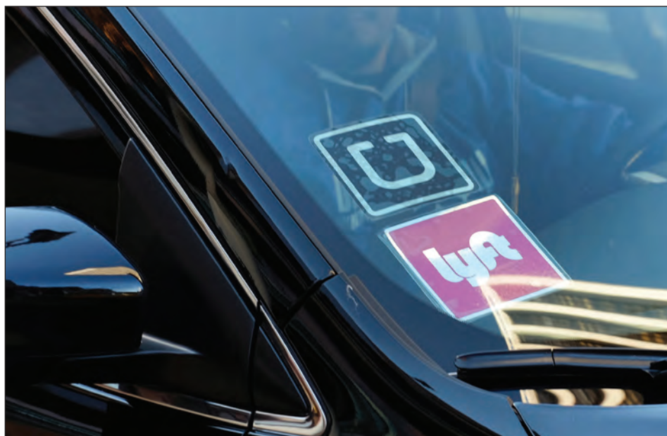
In this Jan. 12, 2016 file photo, a ride share car displays Lyft and Uber stickers on its front windshield. On Tuesday, the Taxi and Limousine Commission approved new minimum pay standards for app-based car services that they say will raise drivers' annual earnings by $10,000 a year.