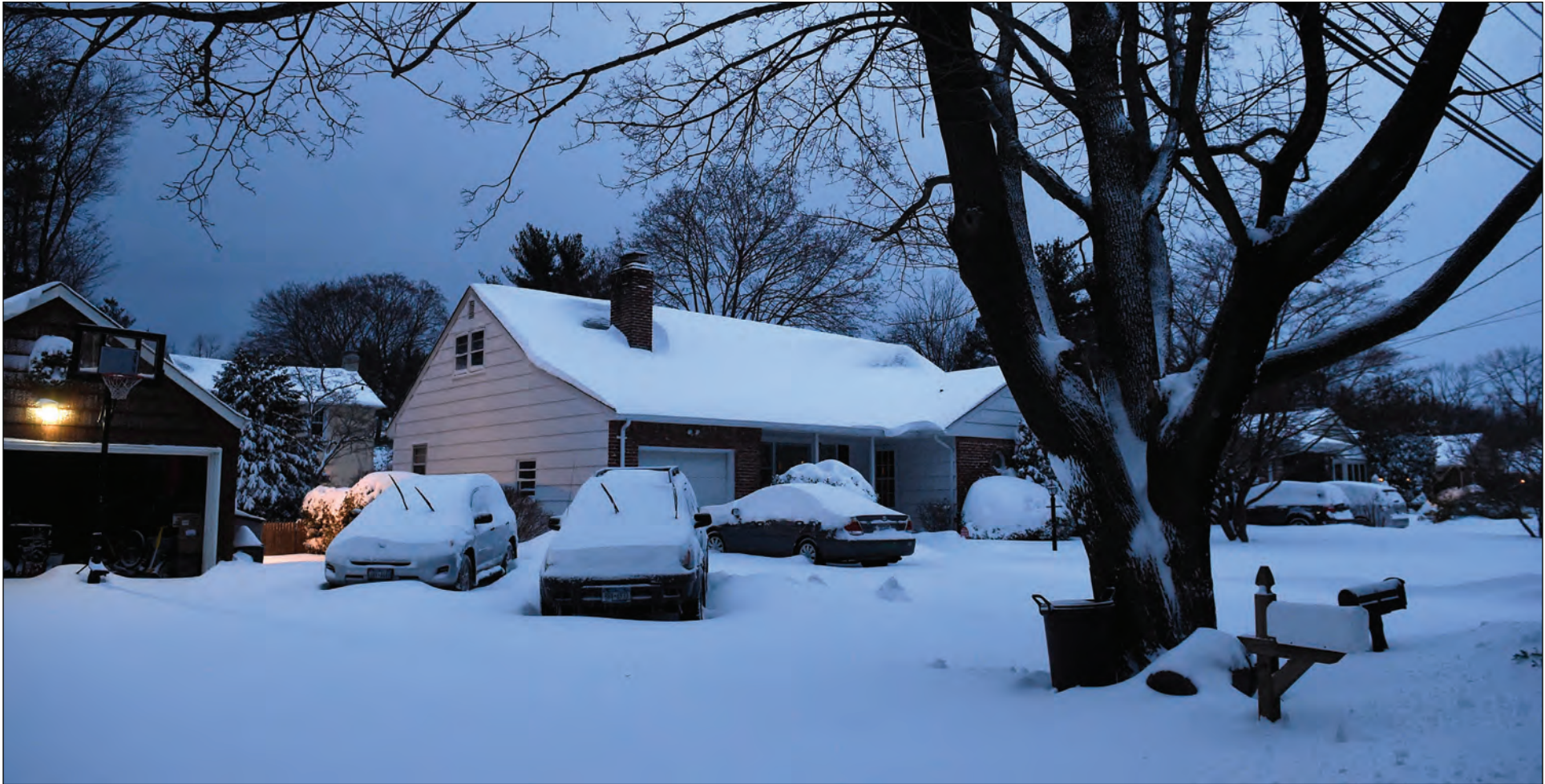
Homes in Sea Cliff, N.Y. in 2015.