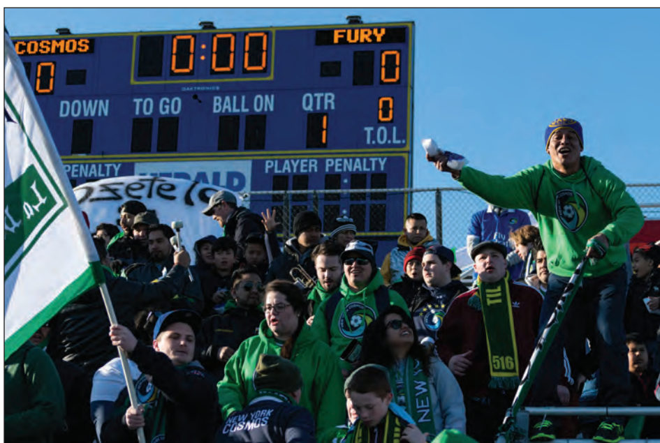
Cosmos supporters cheer on their club at their old home field at Hofstra University.