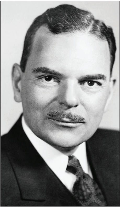
The Dewey Medal is named for Thomas Dewey, former New York County prosecutor and governor of New York from 1943 to 1954.