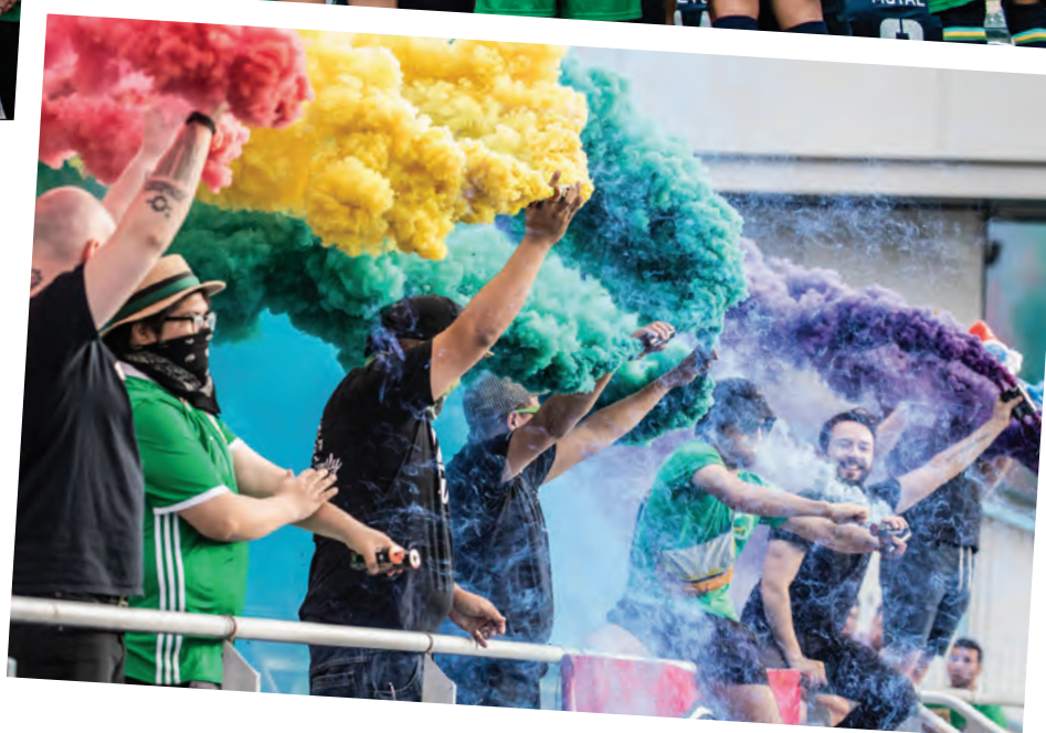
Cosmos fans celebrate in colorful fashion.