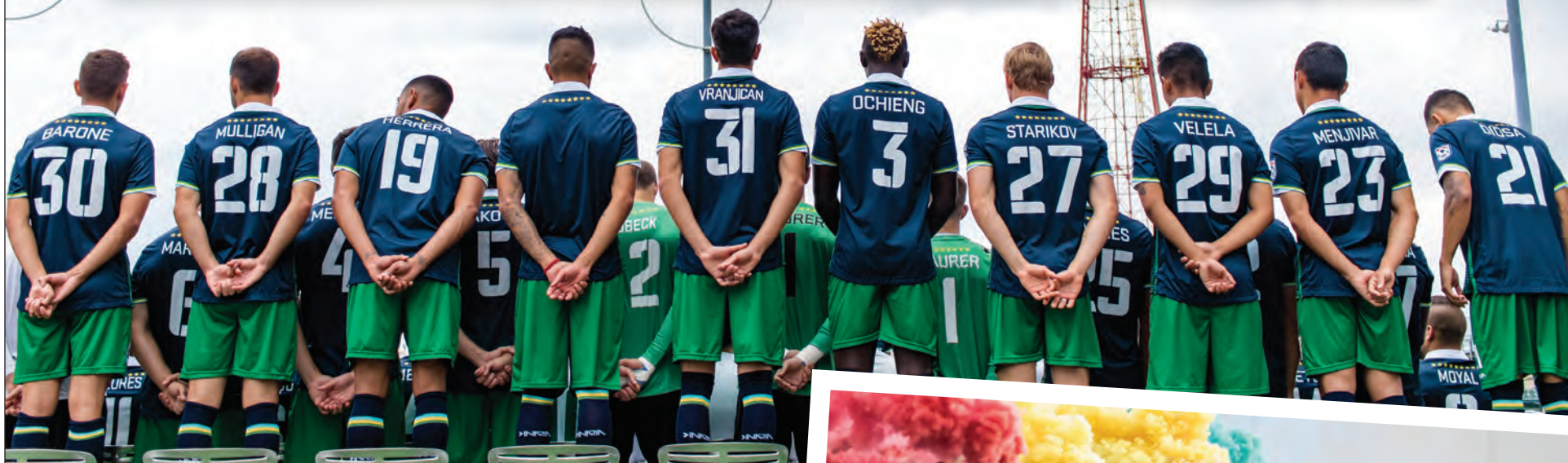
Players stand on the pitch at MCU Field in Coney Island.