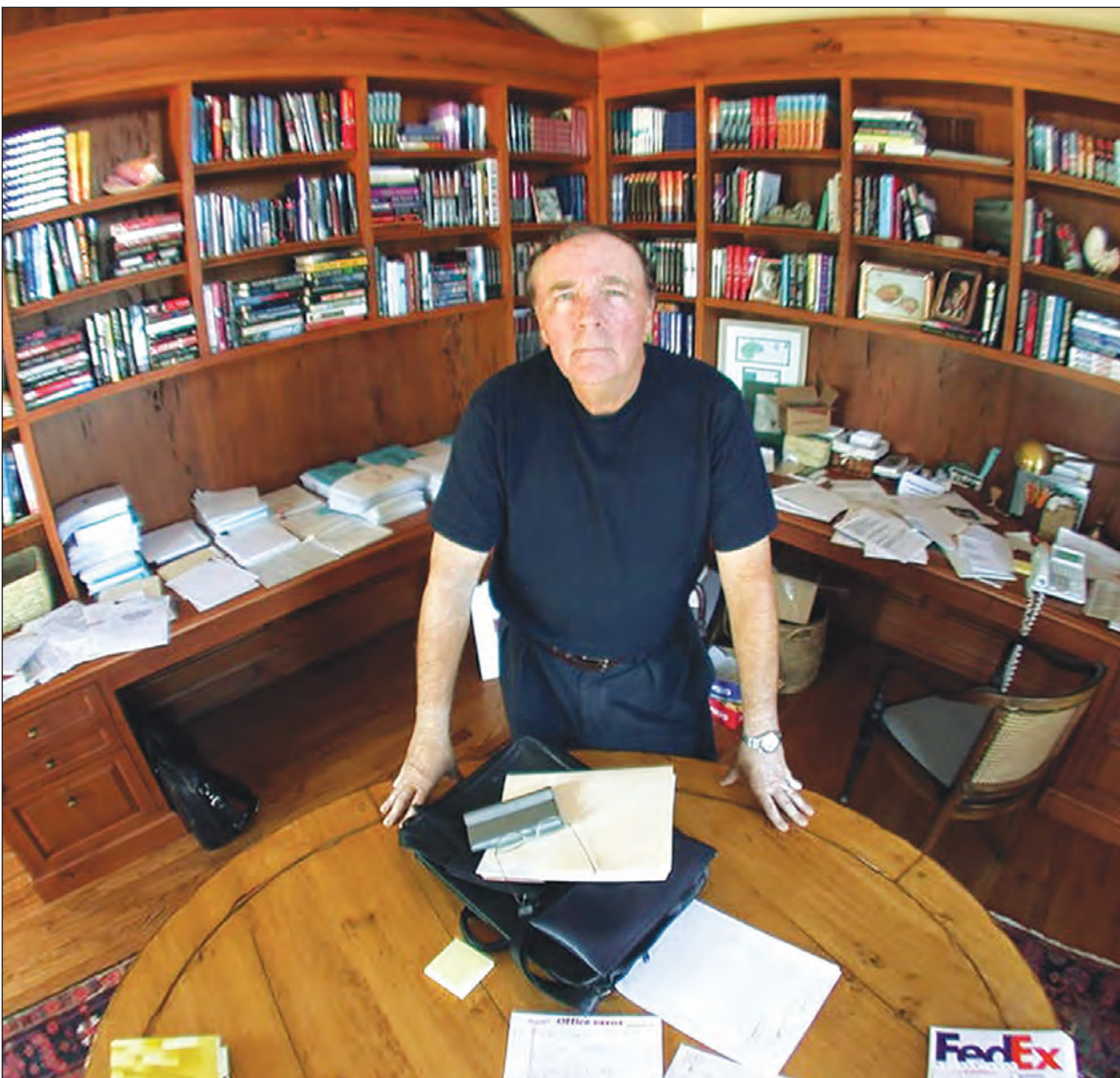
James Patterson has sold more than 100 million copies of his books, grossing more than $1 billion in sales.

In other words, what happens during a brief window of time can foretell a book's success.