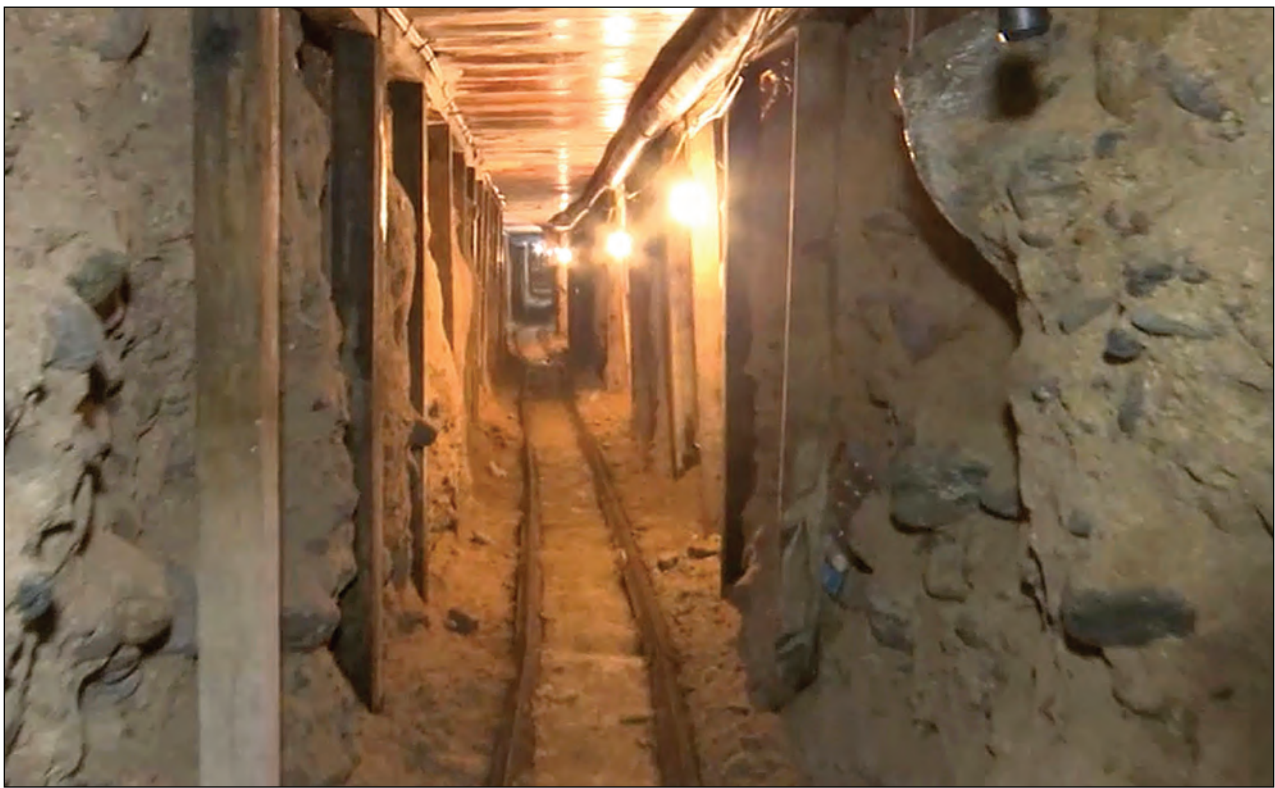
This frame grab taken from a Dec. 12, 2016 video provided by the Mexican Attorney General's Office, or PGR, shows one of two tunnels found in an area of warehouses in the border city of Tijuana that lead into California. Authorities said the tunnels were apparently used by the Sinaloa drug cartel to move drugs into the United States. Witnesses in the trial of accused Mexican drug lord Joaquin "El Chapo" Guzman have said that by means including tunnels dug under the border and fake jalapeno cans, Guzman's cartel smuggled ton-upon-ton of cocaine into the United States during the 1990s and early 2000s.

SMUGGLING BY THE TON The Sinaloa cartel had