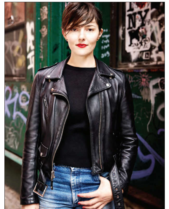
Author Lizzy Goodman

Crafted from nearly 200 original interviews and curated by a writer who remembers the hangovers herself, “Meet Me in the Bathroom” follows in the great