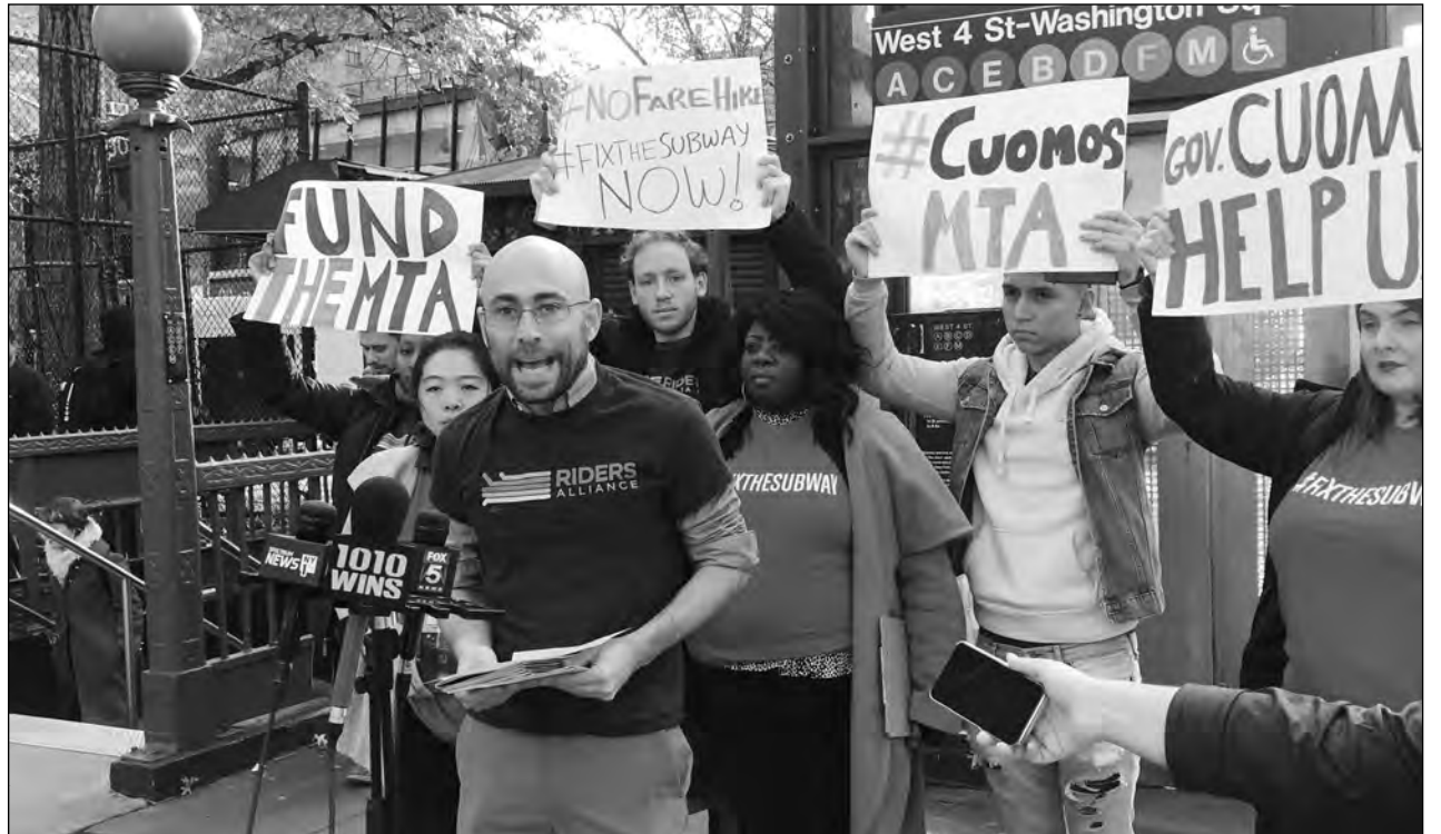
The Riders Alliance held a rally outside the West Fourth Street subway station in Greenwich Village to announce the hurried-up release of a new book detailing the nightmare rides commuters have taken on subways.

without them. Four percent of commuters from the outer boroughs drive into Manhattan. Thirty-eight times as many poor commuters rely on transit to get to work as would pay a congestion charge," the alliance's leaders wrote in a cover letter they are sending to top lawmakers along with the book.