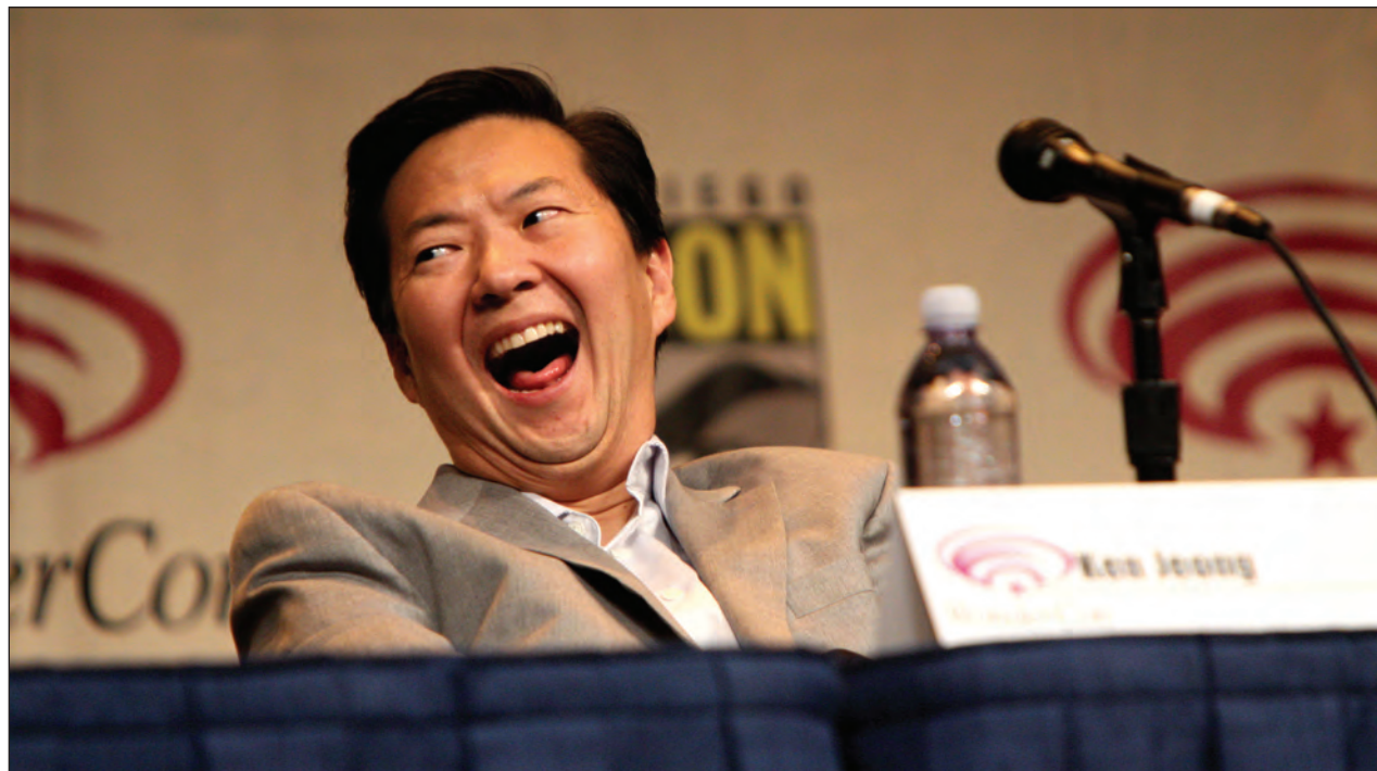
Ken Jeong will perform his stand up comedy at Queens College's Colden Auditorium on Sunday.

Queensborough Performing Arts Center at 222-05 56th Ave. in Bayside