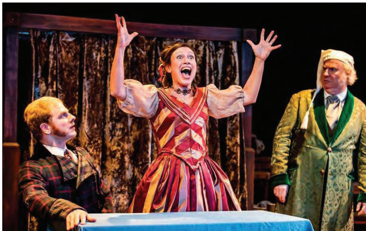
The Titan Theatre Company will perform "A Christmas Carol" at the Queens Theater Friday through Dec. 23.

Onderdonk House, 1820 Flushing Ave. in Ridgewood