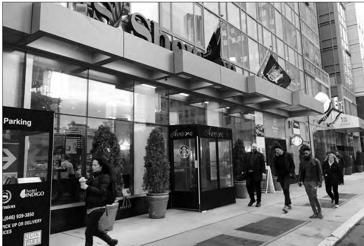
Hundreds of millions of guests learned over the weekend that their personal data, passport numbers and credit card information was stolen from Marriott's Starwood database. Shown: The Sheraton Brooklyn New York Hotel at 228 Duffield St. is one of the Starwood properties affected by the data breach.

"We deeply regret this incident happened," said Marriott's President and Chief Executive Officer Arne Sorenson. "We fell short of what our guests deserve and what we expect of ourselves. We are doing everything we can to support our guests, and using lessons learned to be better moving forward."