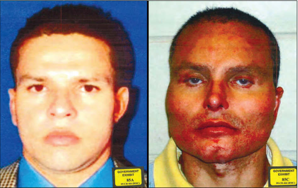
Two photos provided by the U.S. Attorney's Office for the Southern District of New York show former Colombian drug lord Juan Carlos Ramirez Abadia, the latest star witness for the government in the trial against accused drug lord Joaquin "El Chapo" Guzman