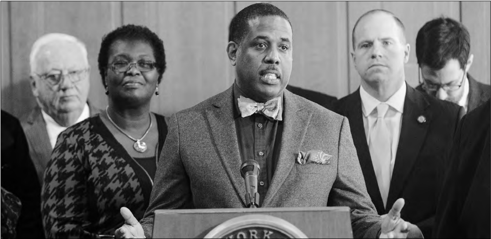
Sen. Kevin Parker (D-Brooklyn) wants to require police to scrutinize social media activity and online searches of handgun license applicants, and disqualify those who make violent or hateful posts. The bill's fate is uncertain amid questions from free-speech advocates.

"If you're afraid of your personal privacy," he said. "Don't apply for a handgun license."